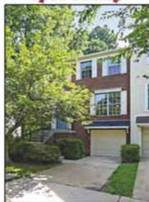
Burke Centre • $384,900 • End Unit TH w/ Garage