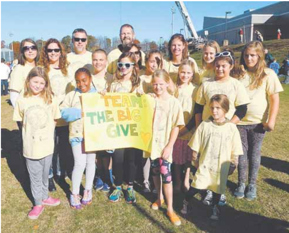
Some of the many members of The Big Give team that participated in the event.