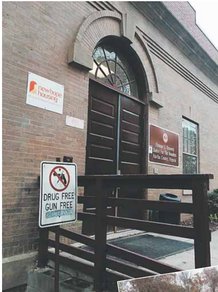
The Eleanor Kennedy Shelter for the Homeless on Richmond Highway.

VETERANS WHO HAVE recently been in service have been in an environment where they have had one important job, protecting the country, and their basic needs like