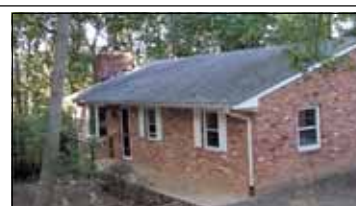
Bull Run Mountain