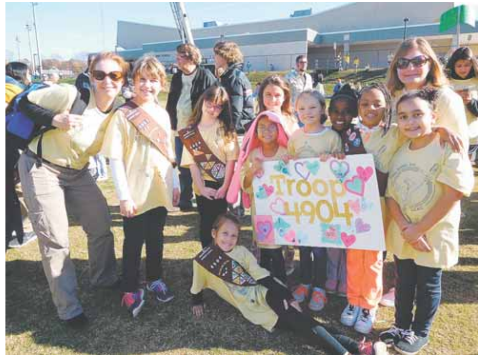
Participants kneel down within the pattern to create the design. Packed inside the blue and gray boxes on the perimeter is the donated food.