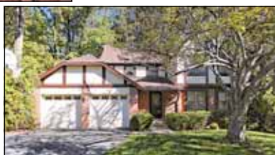
Burke Centre - $624,900

Terrific home with finished walk-out lower level on perfect cul-de-sac lot. Own a piece of VA history!! The McDaniel House, built in 1895 has been lovingly maintained and offers terrific updates.