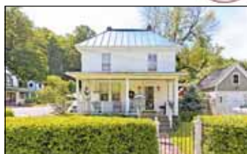
Historic Town of Clifton - $649,000

Terrific home with finished walk-out lower level on perfect cul-de-sac lot. Own a piece of VA history!! The McDaniel House, built in 1895 has been lovingly maintained and offers terrific updates.