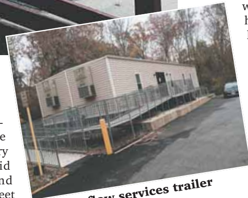
The overflow services trailer on the grounds of the Kennedy Shelter.