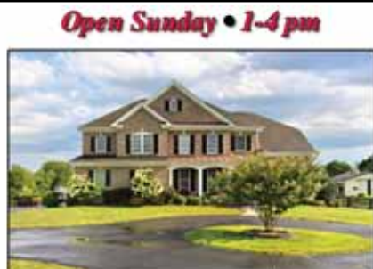
Purecellville, VA 10 Acre Horse Property $824,900