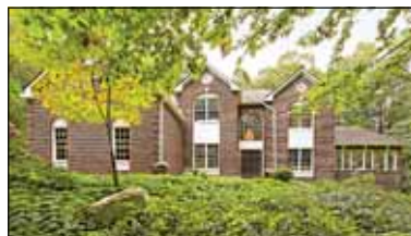
Clifton - $899,000 Located in beautiful Rose Hall community, this stunning home sited on 5 incredible acres boasts terrific updates and attention to detail!

View more photos at www.hermendorfer.com