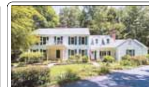
Fairfax Station $939,900 New England charm and Southern hospitality seamlessly blend in Glenver-dant. A home made for enjoying and entertaining complete with updated kitchen and spacious breakfast area nicely located by a wood burning fireplace. Roam through over 5500 square feet including a sunroom and finished basement that offers a full kitchen. The upper level has four large bedrooms and three full baths plus a family den and attic playroom. The exterior features five acres, an inground pool as well as a four stall barn for horse lovers.

Access the Realtors Multiple Listing Service: Go to www.searchvirginia.listingbook.com