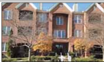
Gainesville Heritage Hunt 55+ $249,900 Sought-after 'Barclay' with sun room! 2BR, 2BA, Den, Gourmet Kit with 42" cabs, NEW Refrigerator, covered Porch, 8' x 8' Storage rm, covered parking with assigned space. HOA fee inc Comcast HS internet, Ph & TV, Gym & pools.