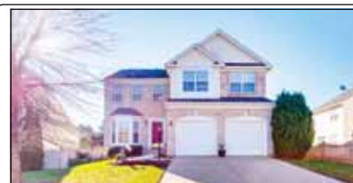
Bristow $434,500 Immaculate & Sunny Home Backing to Woods * Private Fenced Yard & Large Deck * Beautiful Kitchen, Master Bath & Guest Bath Upgrades * Fully Finished Walkout Bsmt w/ Large Rec Rm & Tons of Storage * Near VRE, I66 & New Shops/Dining/Entertainment