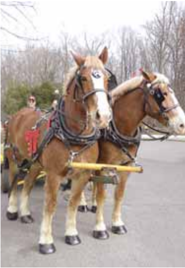
Belgian draft horses from Harmon's Hayrides and Carriages of Brandy Station, Va. take excited riders on a jaunt around Lake Accotink Park in Springfield.