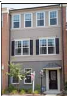
Chantilly $435,000 Two Years New This 3 BR, 2 FB, 2 HB, 3-level TH features gourmet Kit w/granite, Upgraded Cabs, SS Appl, HW Floors, Upgraded Baths, 2-Car Gar, and Much More!