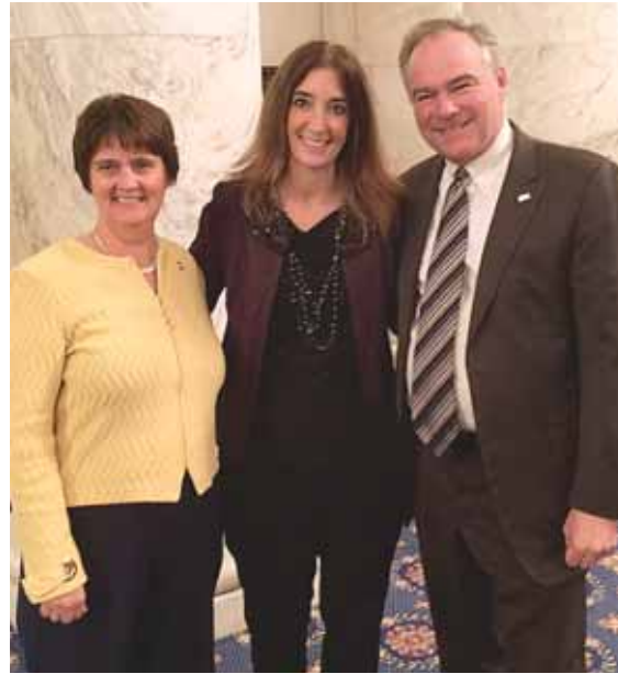
Del. Eileen Filler-Corn with Senator Tim Kaine and Virginia Secretary of Education Anne Holton

In addition to Beyer, Sen. Tim Kaine and Virginia Secretary of