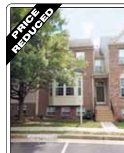
Alexandria $499,000 Must see! Almost 3,000 sq. ft. TH on three levels. Bright & sunny kitchen with hearth and gas FP, upper and lower decks, vaulted ceilings, walk-in closets, soaking tub & separate shower, large basement with ceramic tile floor. Island Creek Elementary School.

NVAR Multi-Million Dollar Club NVAR Top Producer