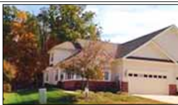
Gainesville Heritage Hunt 55+ $434,900 GORGEOUS 2 lvl 'Turnberry'! 3BR, 3BA, Den, Gourmet Kit, 42" cabs, SS appls, Brkfst rm, HDWDS, Liv, Din, Lndry. MBR w WIC, 2 area Loft, 2 car Gar, NEW Patio, backs to forest!