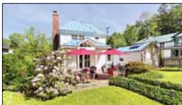
Historic Town of Clifton - $649,000 Built in 1895, this is an incredible opportunity to live in a piece of VA history!