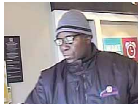
Suspect in Jan. 4 bank robbery.

❖ Dec. 27: The Alexandria Police Department has arrested an adult male after he assaulted and