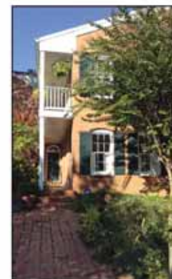
Old Town $950,000