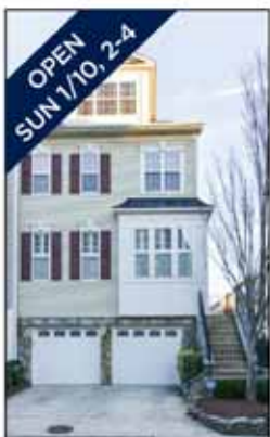
City of Alexandria $589,000