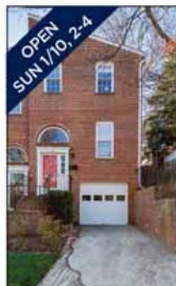
Del Ray $699,000

Light-filled rooms and gorgeous finishes in this townhome will make you forget the winter blues. 3 bedrooms, 2.5 baths, updated eat-in kitchen,