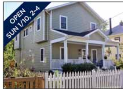
Del Ray $949,000

Gorgeous Craftsman style house built in 2012 just a short walk from The Avenue. 4 bedrooms, 3 baths, hardwood floors, finished storage basement, deck, landscaped garden with flat, fenced backyard, & driveway parking for 4 cars. 209 Laverne Ave.