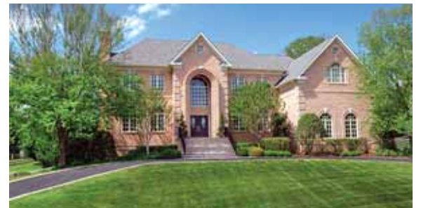
Great Falls $1,795,000