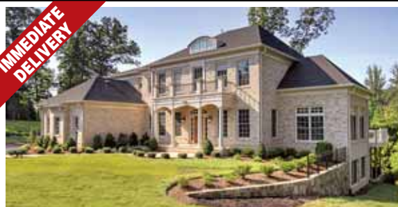
Great Falls $1,699,000