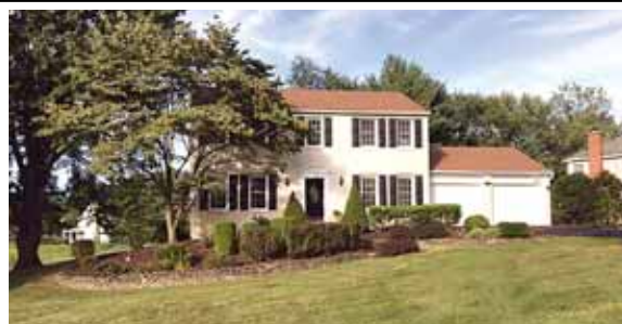
Great Falls $829,000