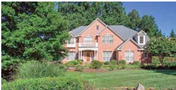
Great Falls $1,495,000