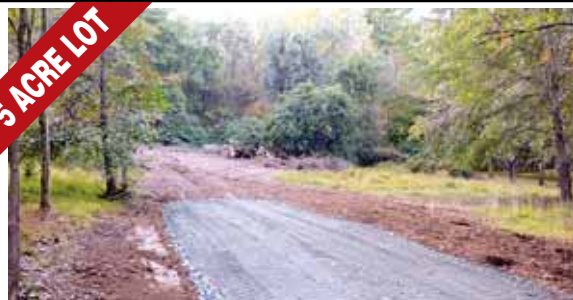
Great Falls $595,000