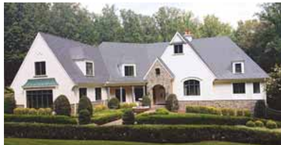
Great Falls $2,499,000