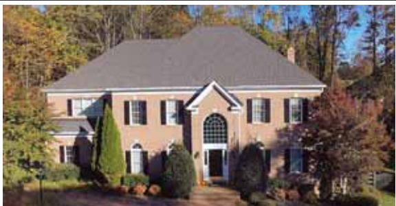
Great Falls $1,879,000