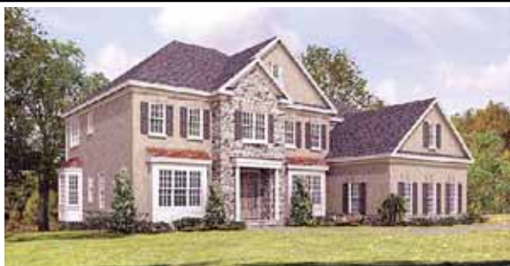
Great Falls $2,099,000