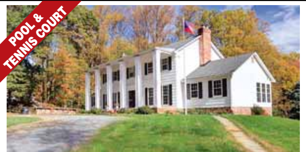
Great Falls $1,325,000