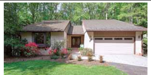
Great Falls $800,000