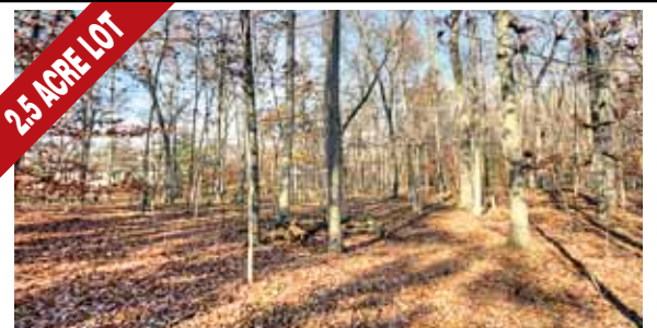
Great Falls $799,000