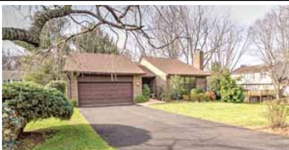
Great Falls $749,000