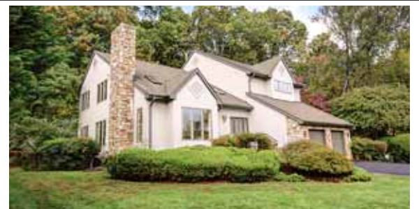
Great Falls $1,299,000