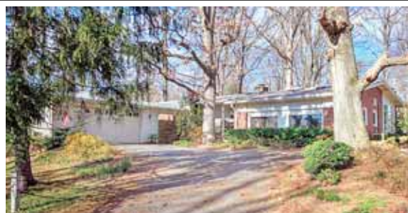
Great Falls $675,000