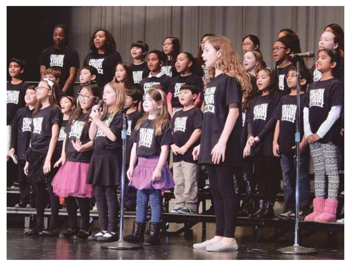
The Colin Powell Elementary Puma Choir sings "Follow Your Dream."