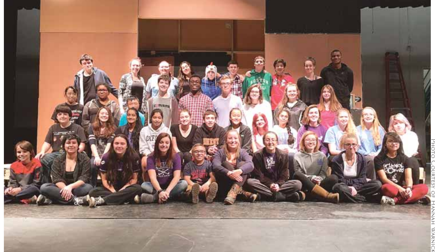
The cast and crew of Chantilly High's "Jack and Jill and the Beanstalk."

mouth and saying the lines, while two other students work the arms."