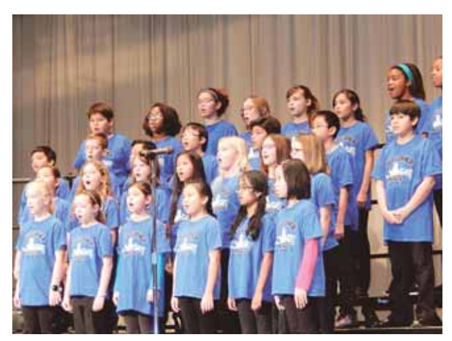
The Lees Corner Elementary Fifth-Grade Choir sings "Like the Beat of a Drum."