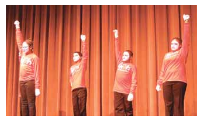
The Chantilly Baptist Church Mime Team illustrates "The Dream."