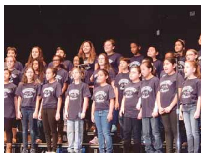
Brookfield Elementary's fifth- and sixth-grade chorus sings "Freedom is Coming."