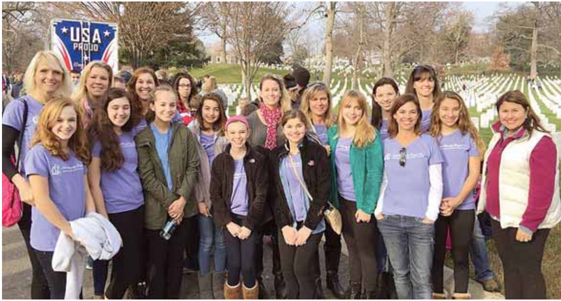
Members of the Virginia Bluebell Chapter of the National Charity League, Inc. support various philanthropies. This past holiday season, the girls and their mothers participated in Wreaths Across America, helping to put a wreath on each headstone at Arlington Cemetery.