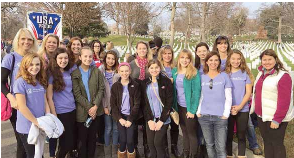
Members of the Virginia Bluebell Chapter of the National Charity League, Inc. support various philanthropies. This past holiday season, the girls and their mothers participated in Wreaths Across America, helping to put a wreath on each headstone at Arlington Cemetery.