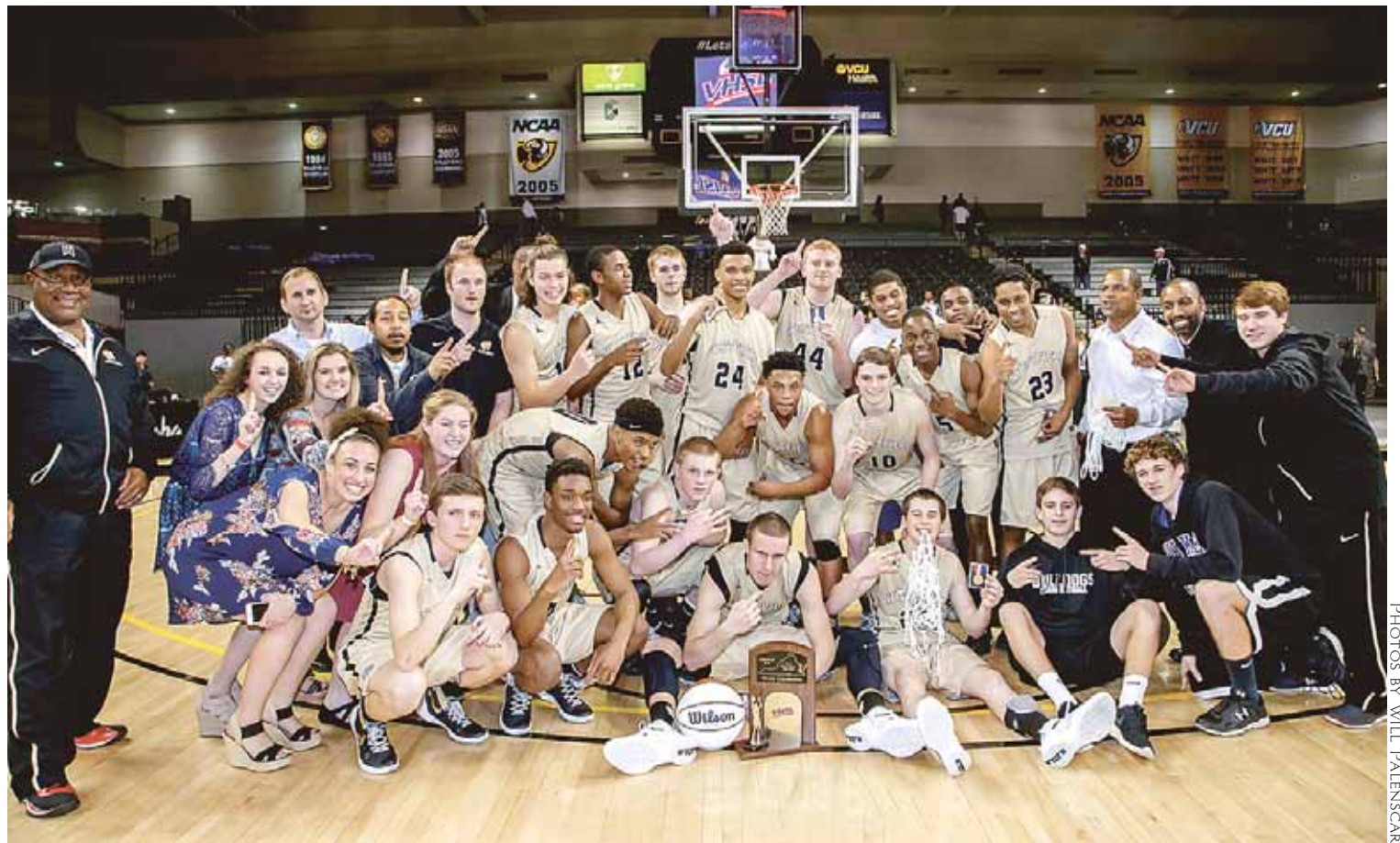
The Westfield boys' basketball team won the 2016 6A state championship.