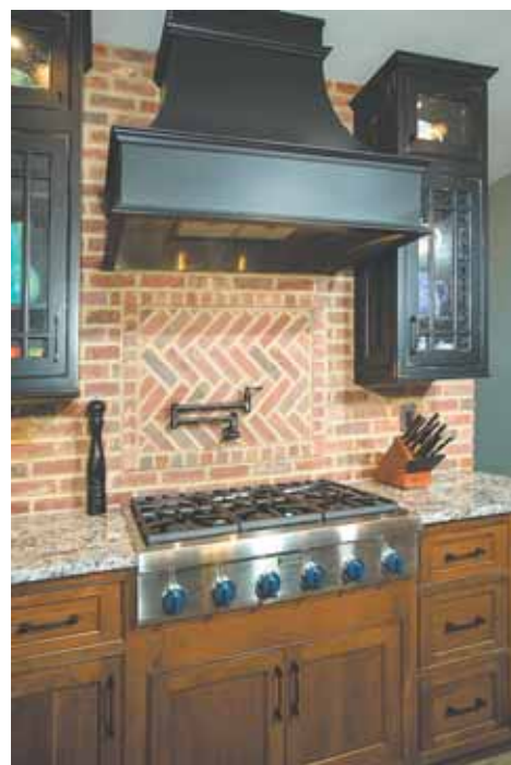
Exposed brick, a cooktop hood and glass-facing cabinets in distressed black mocha glaze are elements in the kitchen’s distinctively rustic interior design.