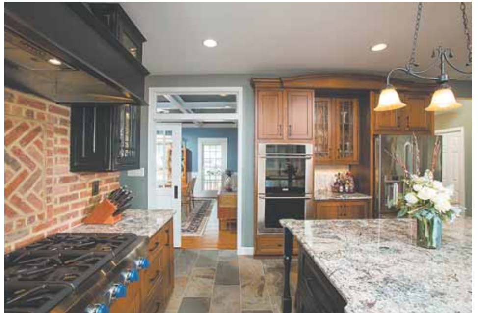
The exposed brick, tile floor and raised square panel cabinet facings create a softly textured, elegant-but-casual interior. The floors conceal a radiant heating system which keeps the room comfortable in cooler temperatures.