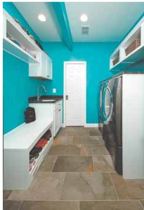
Relocating the hall powder room added square footage needed for a laundry and mudroom that links to the garage.