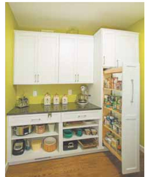
The home’s new rear footprint accommodates walk-in pantry with pull-out storage racks — as well as a larger powder room