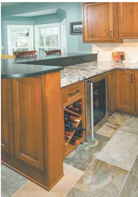
A wine rack and wine refrigerator are convenient to a serving counter convenient to the family room and back deck.