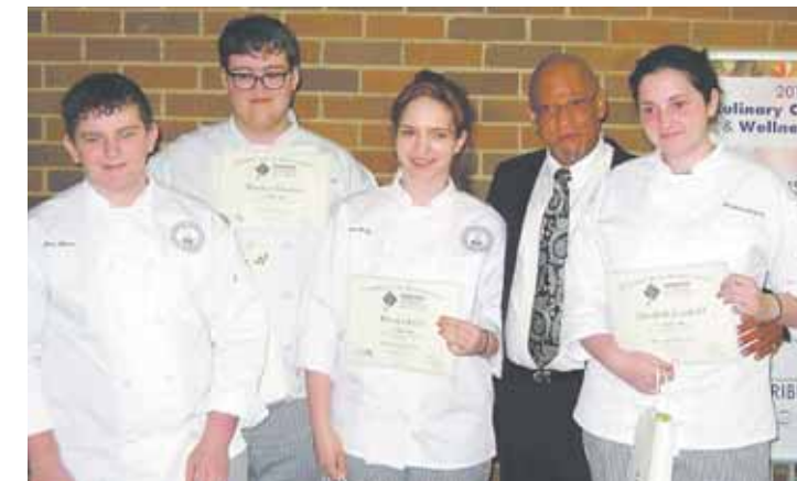
The winner of the first place award in the culinary challenge went to Marshall Academy in Falls Church/McLean. Each student received a $200 scholarship.