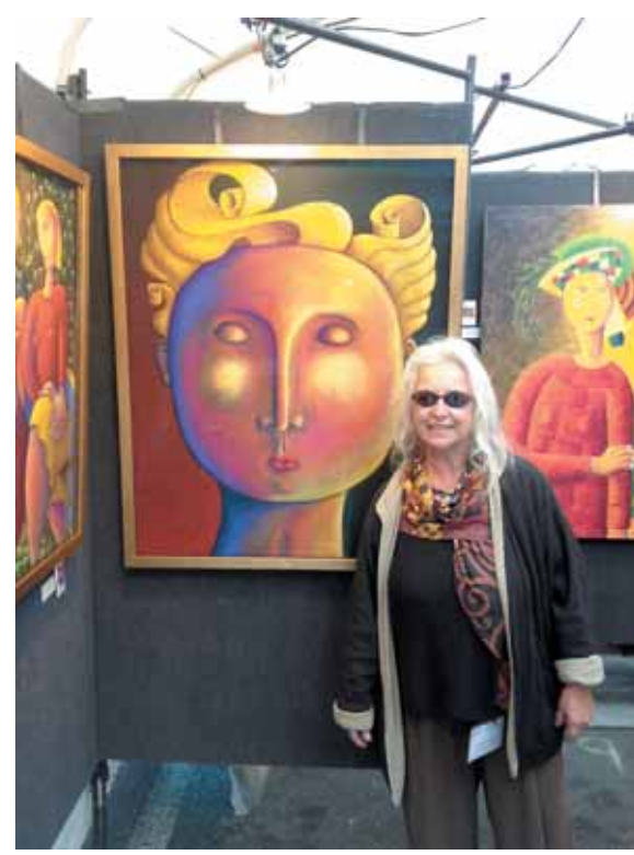
The Northern Virginia Fine Arts Festival will be on Saturday, May 21 at the Reston Town Square Park.