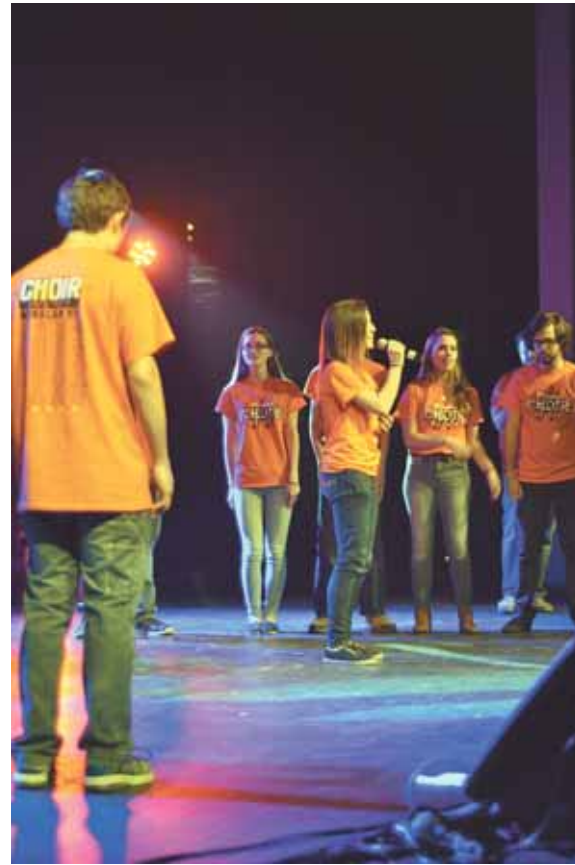
SingStrong A Capella Festival starts Friday, April 1 at South Lakes High School.