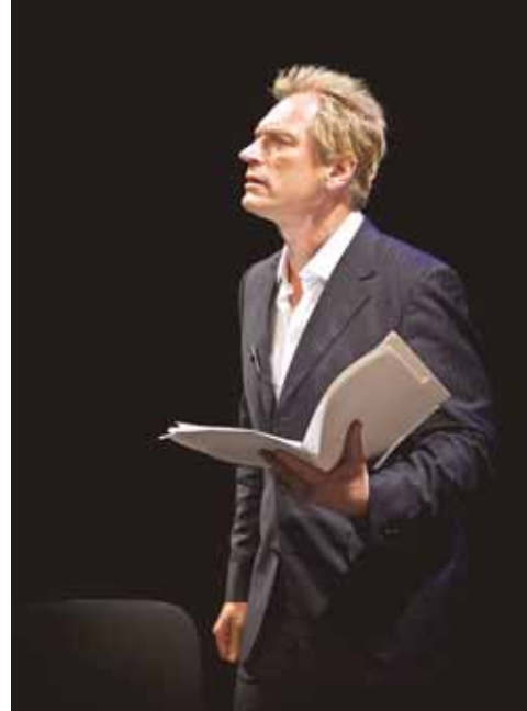
Julian Sands in "A Celebration of Harold Pinter, Directed by John Malkovich."