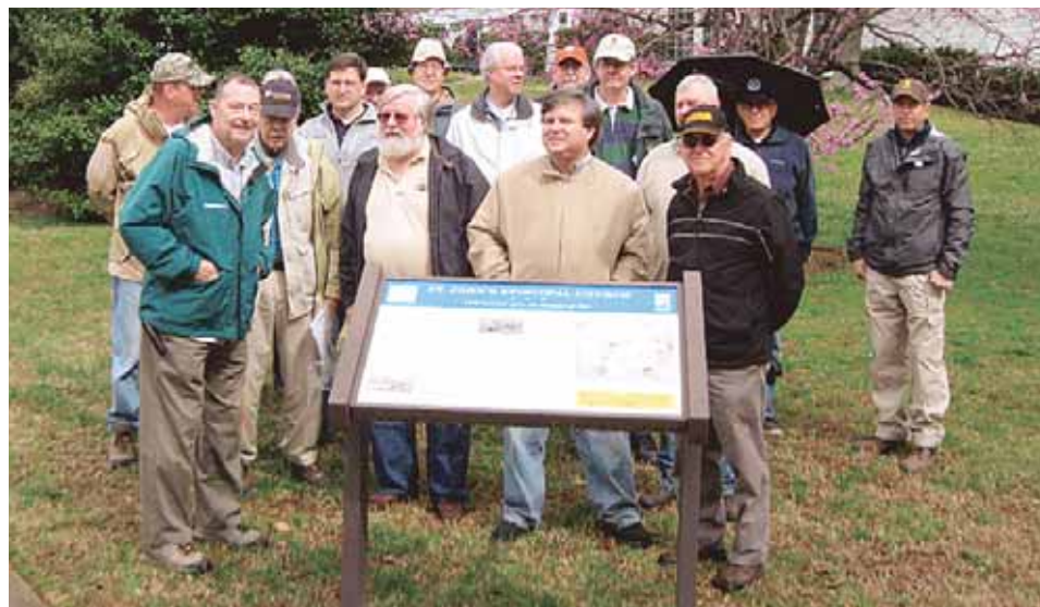
The tour group stopped at St. John's Episcopal Church and Cemetery, built in 1872, in Centreville's Historic District.

The first stop on the tour was Battery Hill Redoubt (Centreville), a fenced-in Civil War site that was built after 1st Manassas and is located off Balmoral Greens Avenue and Cannon Fort Drive, and situated next to the Westfields Golf Club in Clifton. Nine embrasures used for artillery during the Civil War have survived 154 years and are pre-