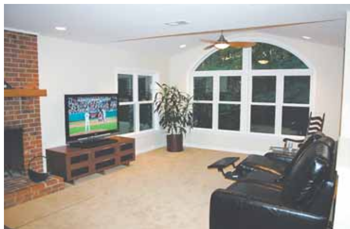
Only 150 square feet was added to the family room, but the four-window course with "eyebrows" creates a visual continuum that makes the room feel significantly larger.