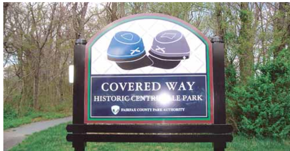
The Covered Way Historic Park off Pickwick Road in Centreville. It had a long covering trench with three forts that was designed to get artillery pieces back and forth without being observed during the Civil War.