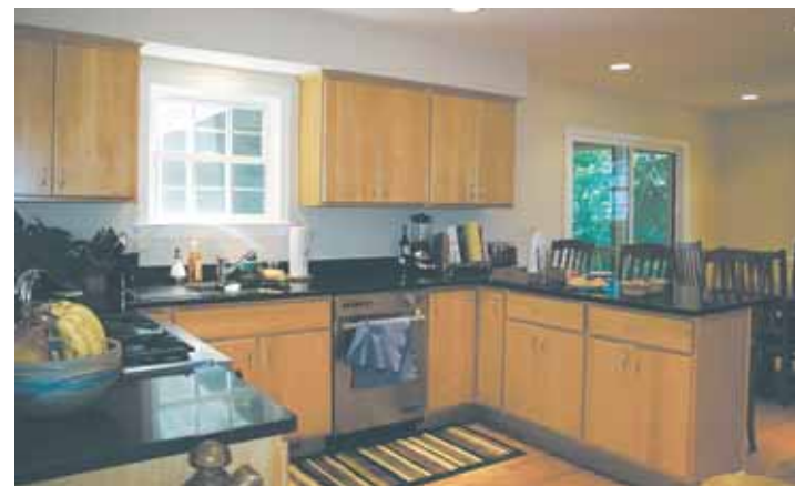
The first phase of a 10 year remodeling plans entailed replacing the kitchen/living room divider wall with a dining counter/serving station. The revisions allowed light from three directions. Maple cabinets and Silestone quartz surfaces provide a tonal and textural contrast.

WHICH LED TO THE THIRD PHASE: Transform the 800-square-foot lower level into an exercise room that doubles as a