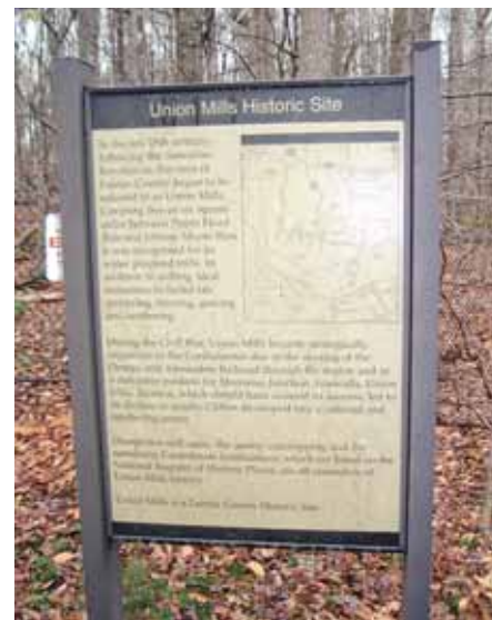
The sign for Union Mills Historic Site in Centreville.