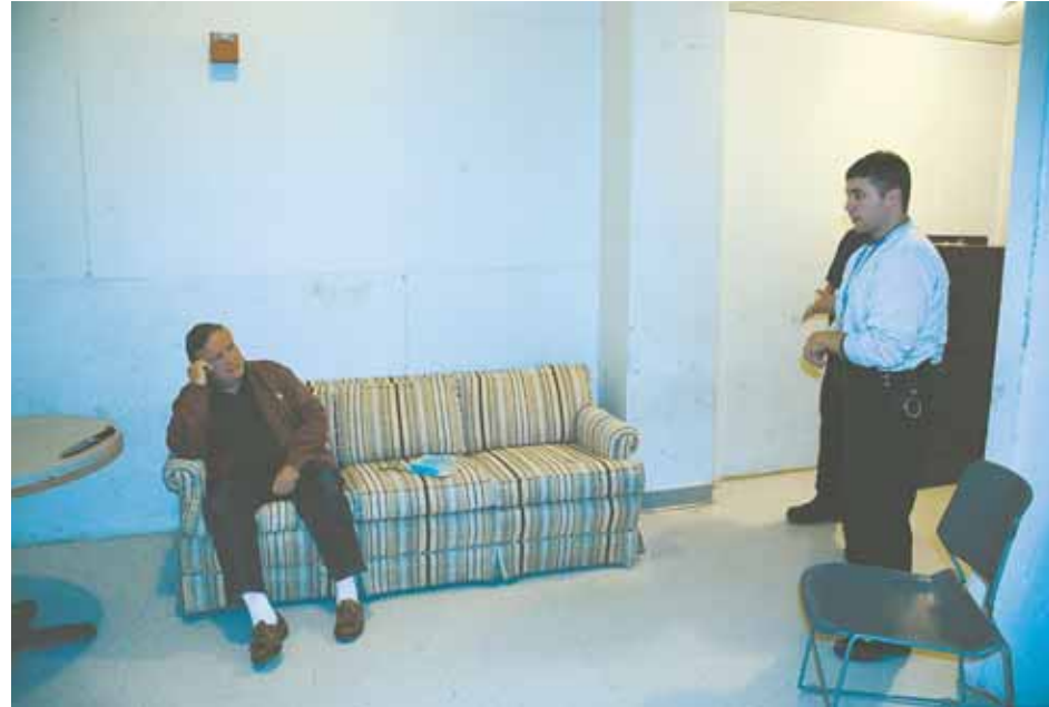
Officers (right) enter a fake residence to talk with a man role-playing as an emotionally disturbed person who was reported in the scenario to be suicidal.