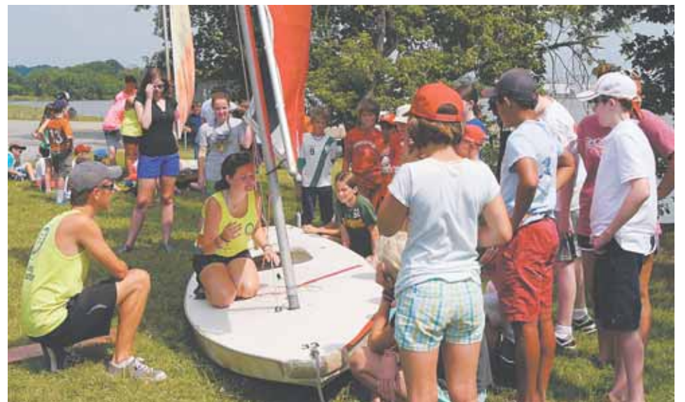
Summer counselors at National Marina Youth Sailing Day Camp give the sailors a safety lesson each day before heading for the Potomac.