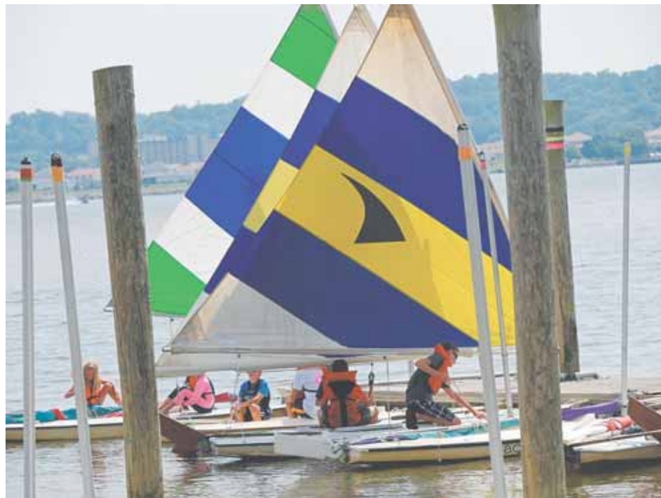
Sailors rig the Sunfish in preparation for beginning the day’s lesson at Youth Sailing Camp at the Washington Sailing Marina.

Classes are already more than 50 percent full for the summer. “Last year we had the