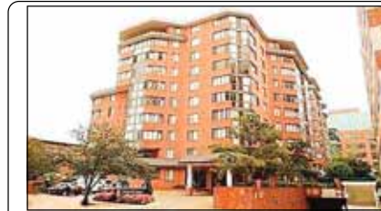
Arlington $435,000 This spacious 2 BR, 1 BA condo w/sunroom, gourmet kitchen, granite, ss appliances, new carpet, garage space w/built-ins and walk-in closet is in the heart of Arlington. 1 block to metro and 2 blocks to mall.