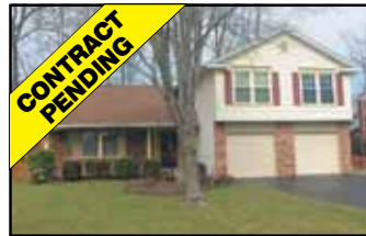
Burke/Longwood Knolls $549,950 Multiple Offers Received

Charming 3 level Cape Cod on premium flat & fenced lot with deck & screened porch, gorgeous remodeled MBA w/ double sinks, remodeled kit w/ 42" cabinets, SS appl & granite cnts, fin walkout bsmt w/ plenty of storage, vinyl windows, walk to restaurants, 7/11, grocery store & more.