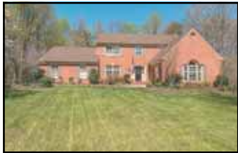
Fairfax Sta/South Run $834,950 Remodeled Eat-in Kitchen

Rarely available model w/ step down living room w/ high ceilings, library w/ bay window, huge flat & cleared lot, deck, fin walkout bsmt w/ BR & full bath, remodeled kit w/ maple cabinets, granite cnts & SS appliances, hardwood flrs on 2 levels, elegant moldings & plantation shutters, many updates & more.