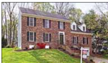
Burke Centre - $665,000 Terrific brick-front home; convenient location yet private backing to woods. 4 BR, 2 full & 2 half baths.