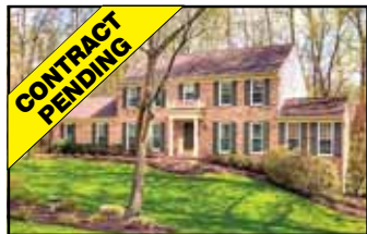
Fairfax Sta/South Run $839,950 Multiple Offers Received

Premium half acre lot backing to parkland w/ deck, remodeled kitchen w/ granite cnts, lovely hrdwd floors, remodeled MBA w/ double sinks & sep tub & shower, MBR w/ walk-in closet, remodeled hall BA w/ jetted tub, newer vinyl windows, siding, furnace & a/c, near Silver Line Metro & more.