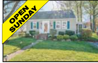
Fairfax City $469,950 OPEN SUNDAY 5/1 1-4

Lovely colonial w/ remodeled eat-in kit w/ maple cabinets, SS appl & granite counters, library, screened porch, multi-level deck, fresh paint, new carpet, finished walkout bsmt w/ 5th BR & full bath, spacious MBA w/ skylt, double sinks & sep tub & shower, replaced windows, HVAC, roof & more.