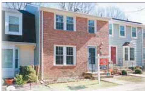
BURKE CENTRE $399,900

Beautiful home w/3 finished levels, spacious eat-in kitchen, separate dining & living rooms, walkout recreation room & so much more. Great location near VRE Stations, public transportation, shopping & commuter routes. 5711 Walnut Wood Ln, Burke.