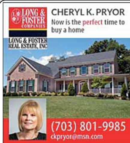
CHERYL K. PRYOR Now is the perfect time to buy a home

Sunny End Unit 2 BR, 2 FB, 1 HB end unit in popular Little Rocky Run. Updated baths, hardwood floors, deck, fenced yard. Open floor plan.