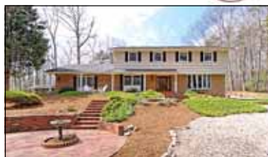
Fairfax Station - $929,900 Gorgeous 5 acre setting with extensive landscaping, incredible chef's kitchen & 2-story family room addition.

View more photos at www.hermendorfer.com