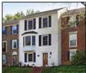
West Springfield • Rhygate Close to Clubhouse • $485,000