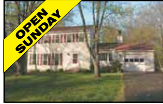
Reston $514,950 OPEN SUNDAY 5/1 1-4

Rarely available model w/ step down living room w/ high ceilings, library w/ bay window, huge flat & cleared lot, deck, fin walkout bsmt w/ BR & full bath, remodeled kit w/ maple cabinets, granite cnts & SS appliances, hardwood flrs on 2 levels, elegant moldings & plantation shutters, many updates & more.