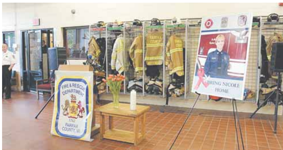
Photos of Nicole Mittendorff were positioned in front of the locker where firefighter-paramedic gear is kept.