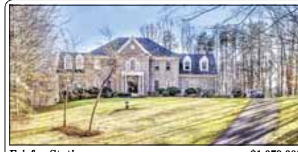
Fairfax Station $1,079,000 Gorgeous 5 Bedroom, 3 Full/2 Half Bath Home. Approx 6400 sq. ft. 3 Finished Levels. 5+ acres. Gourmet Kitchen, Large Formal Dining Room, Hardwood & Ceramic Tile Flooring, Large Library with Custom Built-In Bookshelves. Much More.

Selling Virginia's Finest Homes Member, NVAR Multi Million Dollar Sales Club