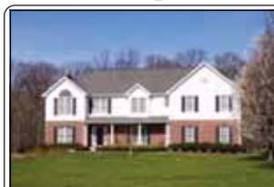
Round Hill Coming Soon

"Put Pep's Energy to Work for You" 703-314-7055 PepLnF.com