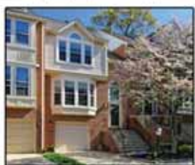
Fairfax • Penderbrook Backs to 17th Hole • $549,900