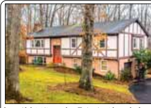
Fairfax Station $614,900

Life Members, NVAR Top Producers Multi-Million Dollar Sales Club