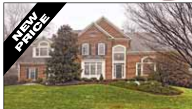
Fairfax Station - $1,100,000

View more photos at www.hermendorfer.com