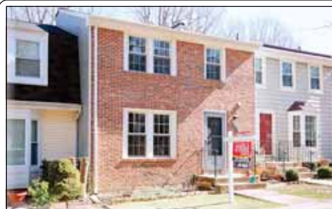
Burke Centre $399,900

Beautiful home w/3 finished levels, spacious eat-in kitchen, separate dining & living rooms, walkout recreation room & so much more. Great location near VRE Stations, public transportation, shopping, and commuter routes.