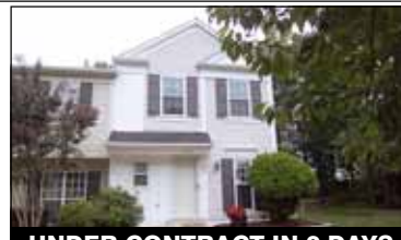
UNDER CONTRACT IN 2 DAYS

Lake Ridge $229,999 All my listings are under contract!! It's a great time to sell. Even if you are just thinking about selling, I am always happy to give you my professional advice. If you want RESULTS, call me.