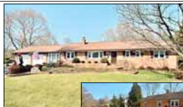
ALEXANDRIA $529,000 ONE LEVEL LIVING!!

Spectacular all-brick beauty sited on just under an acre will not last!