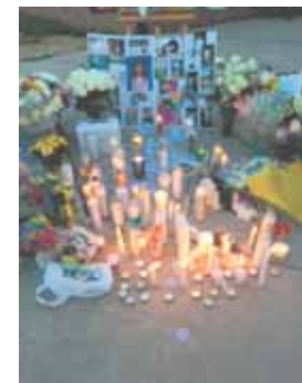
Lake Braddock Secondary School student Brenda Soto was found unresponsive in a school bathroom just before 6 p.m. on April 20.