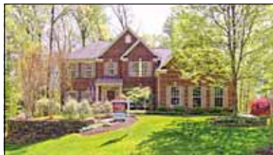
Clifton - $949,000

Located on a gorgeous .94 acre in Balmoral Greens, this meticulously maintained home sparkles inside and out!