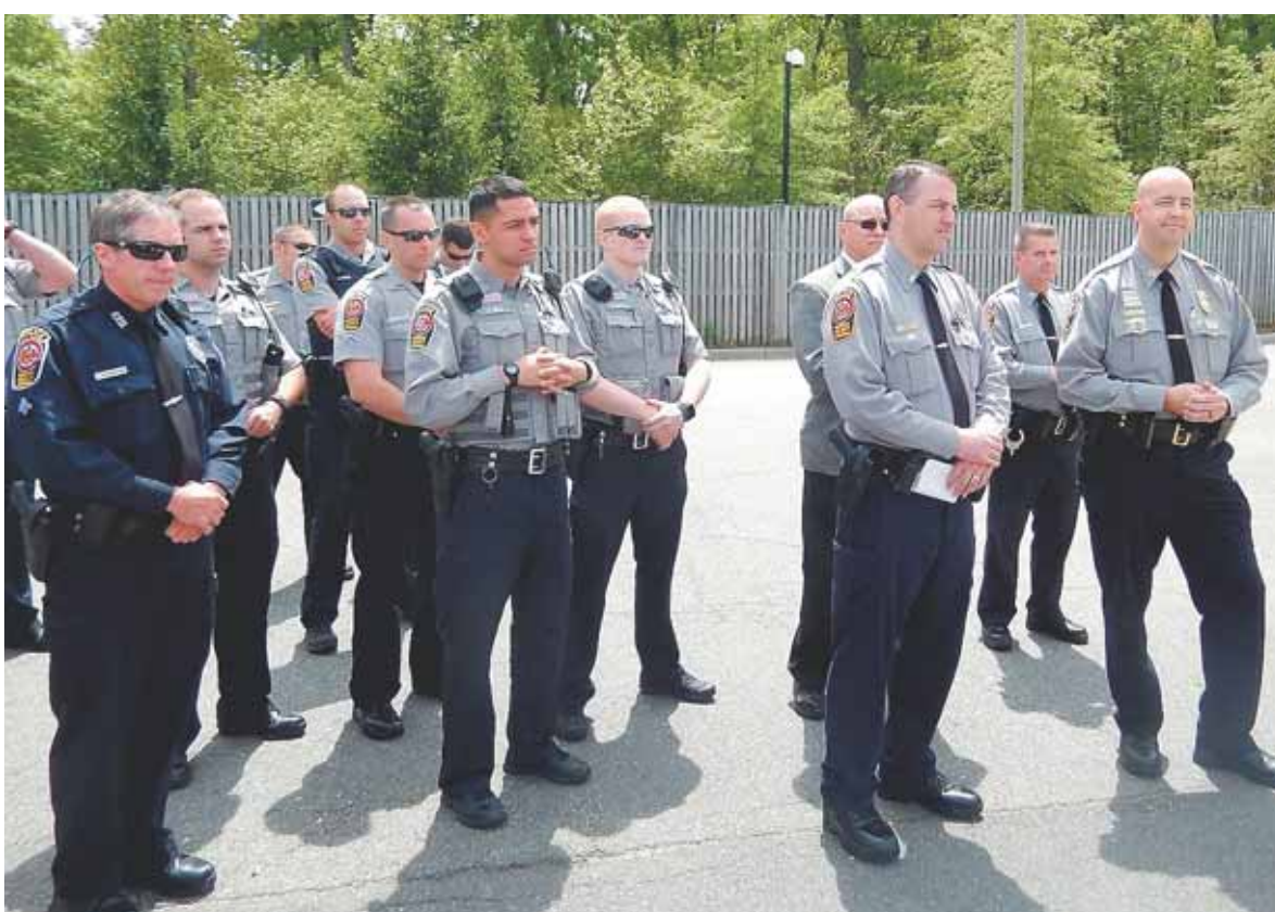
Some of the police officers at the remembrance ceremony.