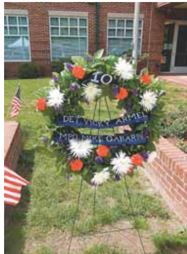
A wreath in honor of the two, fallen officers.