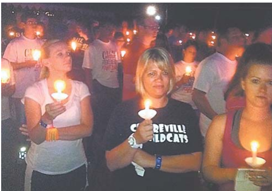
Participants hold candles during a previous luminaria ceremony.