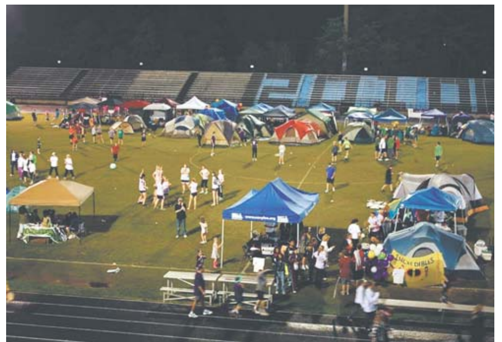
Campsites at a past Relay for Life event.