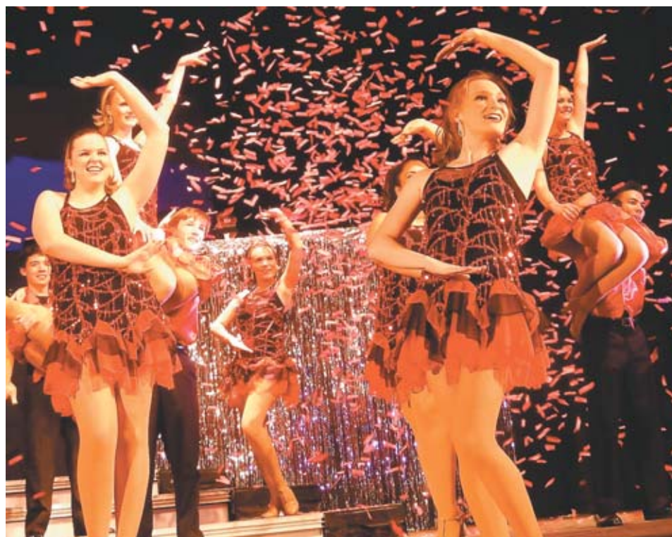
The 2015 Jazz & Pizzazz finale, "Conga Rhythm."