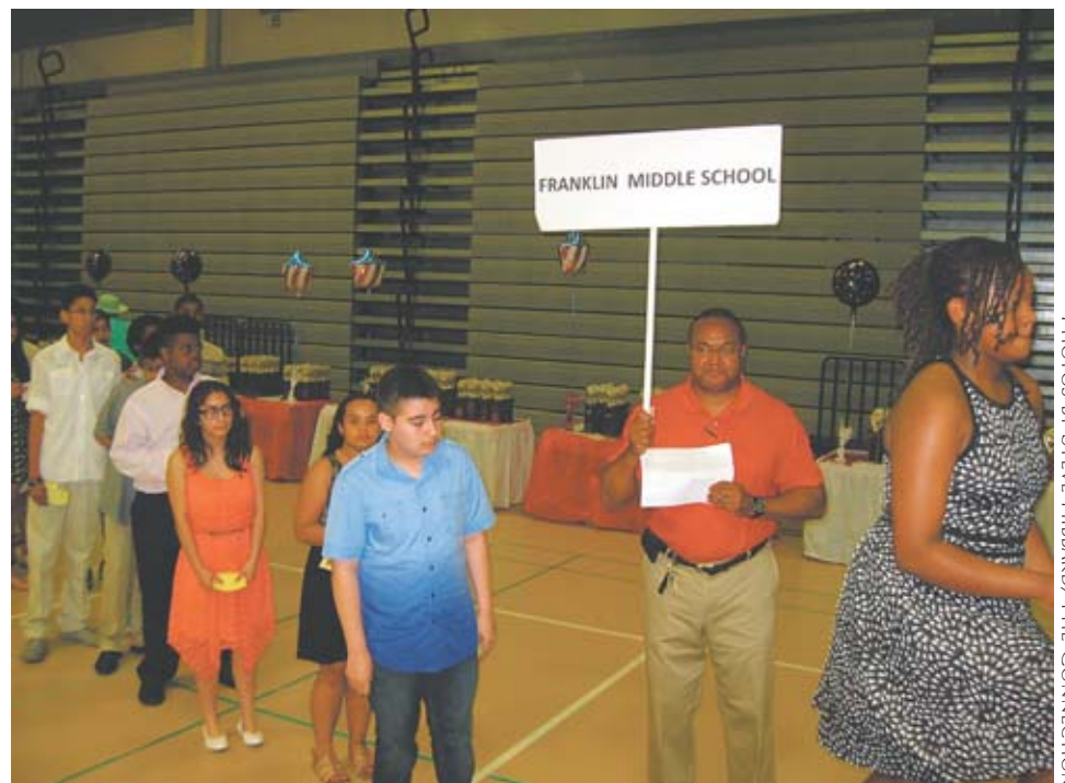
Students from Franklin Middle School make their way to the stage.