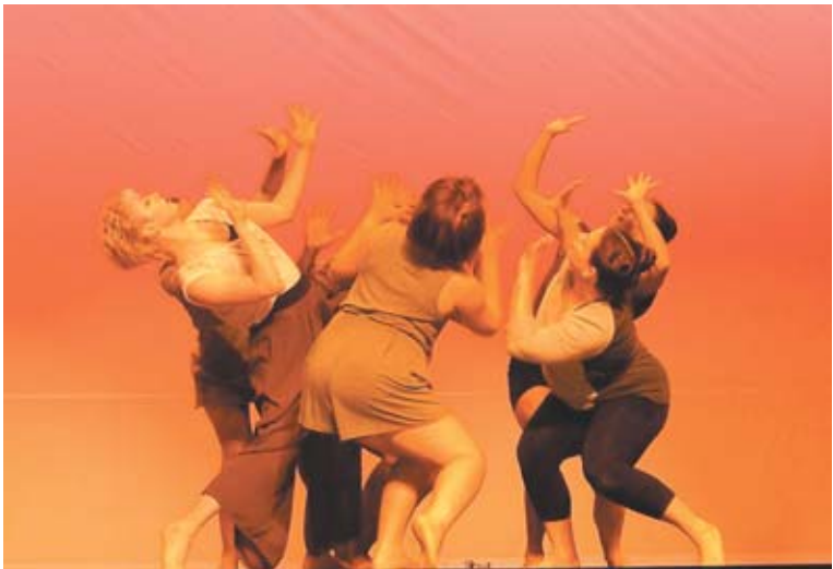
A group of friends performs the dance number, “Poems.”