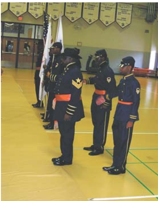
The Mount Olive Baptist Church Junior Buffalo Soldiers Drill Team performs.