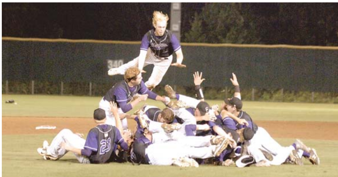
Members of the Chantilly baseball team celebrate winning the 6A North region championship on Friday.