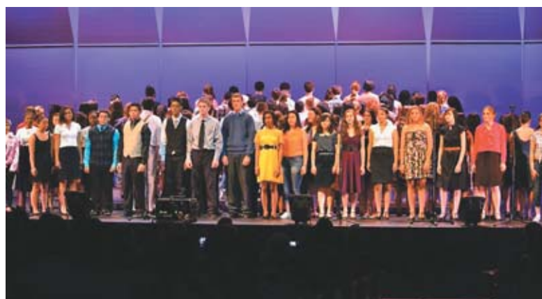
Centreville High choral students perform their opening number in a previous "Broadway Pops" concert.

The show will open with "Ease on Down the Road" from "The Wiz," performed by all the choirs. Then the Madrigal Ensemble