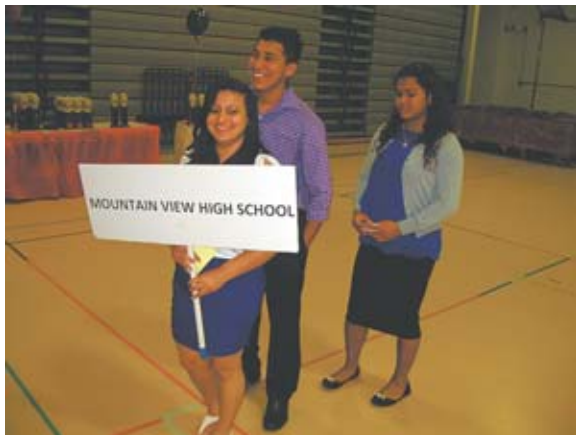
Mountain View High School students make their way to the stage.