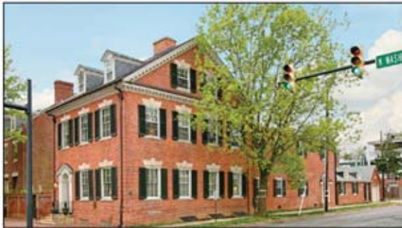
Old Town Alexandria

The Edmund Jennings Lee House, circa 1801, one of the era's finest examples of Georgian architecture, boasts 4 bedrooms, 6.5 bathrooms, 5 fireplaces and 6,963 total square feet. Features include: A period-perfect drawing room with 11-foot ceiling and original hardwood floors, grand dining room, eat-in kitchen, enclosed sleeping porch, a tavern room in the brick basement and a garage. The private, walled garden and brick courtyard, a colonnaded gallery, and in-ground pool provide ample space for outdoor dining and entertaining.