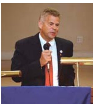
John C. Harvey, Jr. (right), Virginia Secretary of Veterans and Defense Affairs, introduces Gov. Terry McAuliffe (D) June 1 at American Legion Post 176 in Springfield.