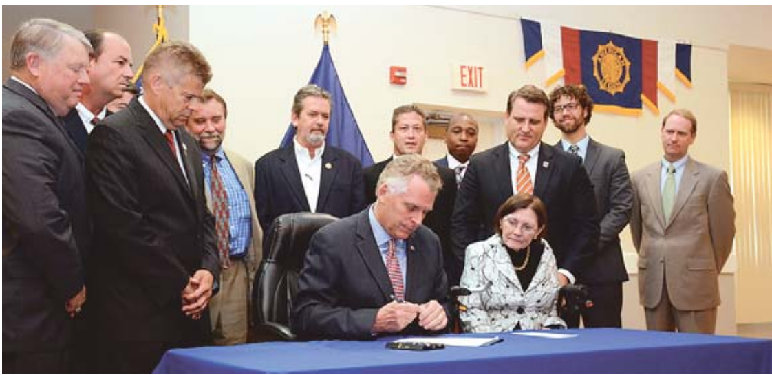
Gov. Terry McAuliffe (D) (center) signs HB 477, which allows for $29.3 million in bonds plus financing costs for constructing veterans care centers in Northern Virginia and the Hampton Roads areas.