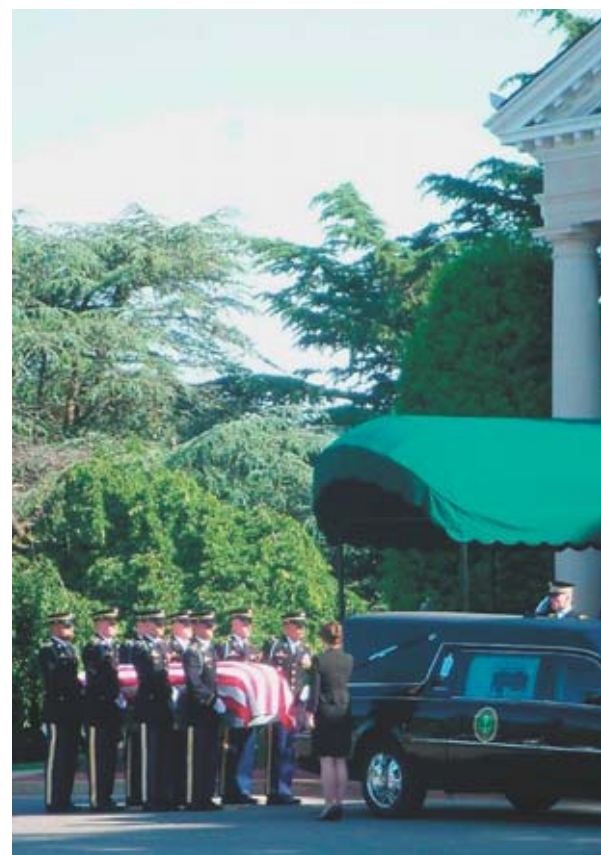
The Old Post Chapel of Joint Base Myer-Henderson Hall