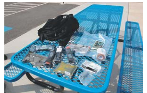
Each of the Town of Herndon's 55 sworn officers will now be equipped with a backpack containing supplies to help them provide life-saving care to themselves or others before emergency medical technicians can get on the scene.

Habitat for Humanity of Northern Virginia