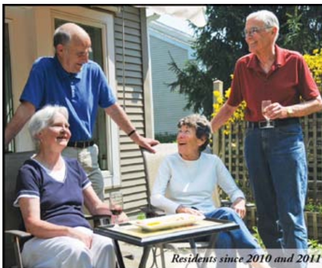
Residents since 2010 and 2011

LIFETIME CONNECTIONS BEGIN WITH EVERYDAY MOMENTS.