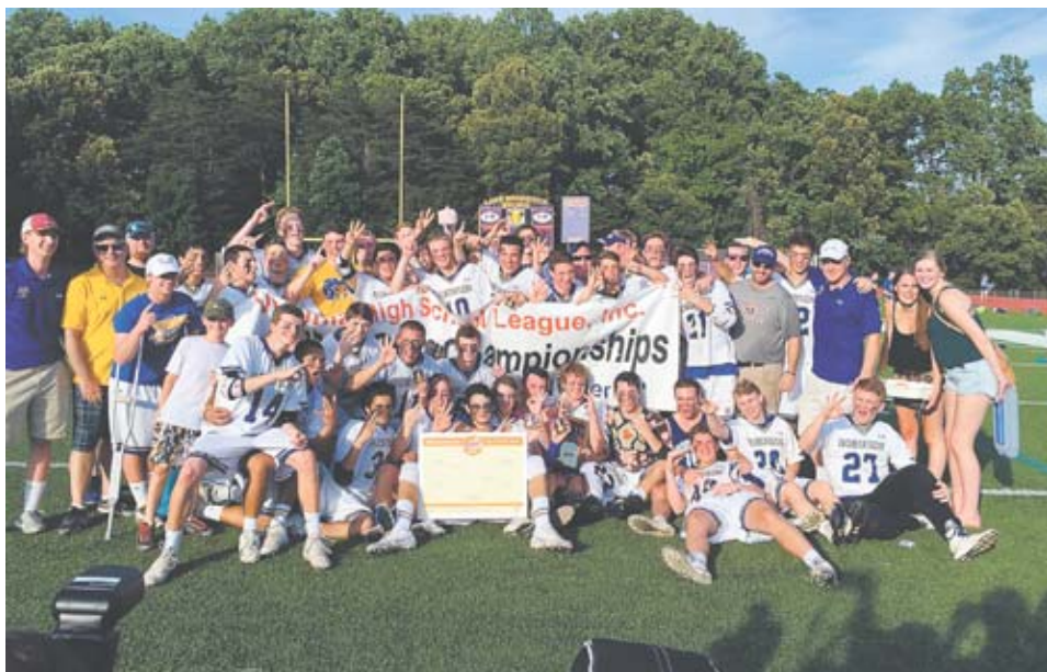
The Robinson boys' lacrosse team won its third consecutive state championship with a 14-2 victory over James River on Saturday at Lake Braddock Secondary School.