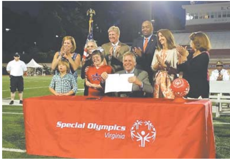
Governor Terry McAuliffe signs Del. Eileen Filler-Corn's bill, HB 1103.

"After meeting with Virginia 529 last fall, I found out that while Virginia ABLE accounts would be exempt from federal means testing, they could be subject to state means testing. If we didn't act, some families might decide to avoid ABLE accounts and their advantages for fear of an adverse impact on eligibility for critical state benefits pro-