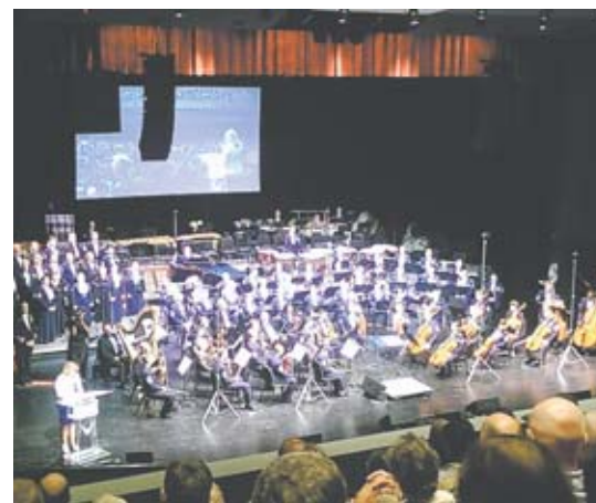
Secretary of the Air Force Deborah James (bottom left) welcomes the audience to the U.S. Air Force Band 75th Anniversary Reunion Concert, held at the George Mason Center for the Arts on June 11.

The final two pieces, "The Battle Hymn of the