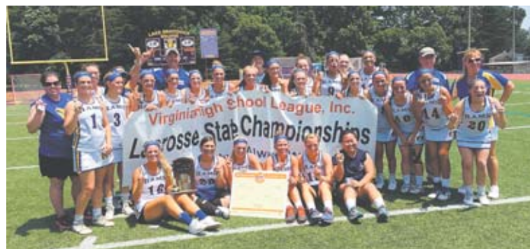
The Robinson girls' lacrosse team repeated as state champion with a 13-9 victory over Woodson on Saturday at Lake Braddock Secondary School.

Robinson defeated Woodson 13-9 and brought home its second