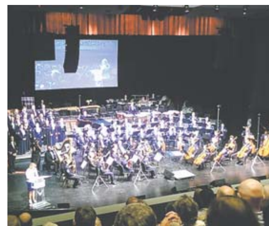
Secretary of the Air Force Deborah James (bottom left) welcomes the audience to the U.S. Air Force Band 75th Anniversary Reunion Concert, held at the George Mason Center for the Arts on June 11.

The final two pieces, "The Battle Hymn of the