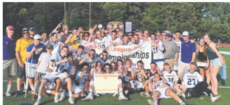
The Robinson boys' lacrosse team won its third consecutive state championship with a 14-2 victory over James River on Saturday at Lake Braddock Secondary School.

consecutive state championship Saturday afternoon at Lake Braddock Secondary school.