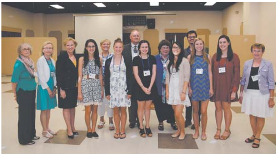
The Fairfax County Retired Educators administered seven scholarships to students aspiring to become teachers at a June 9 luncheon.