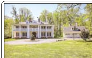
Falls Church $1,820,000