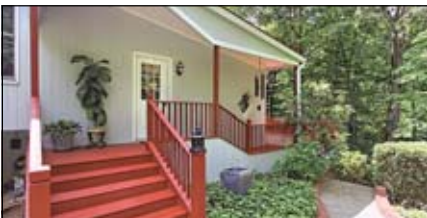
Clifton - $799,000

This is a true gem! Custom home with open floor plan, beautifully updated kitchen, sited on lovely landscaped 3.5 acres in the historic town of Clifton.