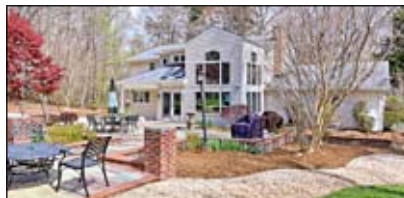
Fairfax Station - $929,900

View more photos at www.hermendorfer.com