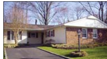
Fairfax RENTED $2,250

Great home conveniently located on a small Cul-de-Sac - Immaculate & ready to move into immediately! Recently renovated - New Refrigerator - HW Floors - Family Rm with Bay Window & Built-ins adjacent to Kitchen - Separate Laundry Rm.