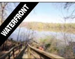
Lake Ocoquan Shores RARE OPPORTUNITY $700,000

Secluded waterfront community of 5 acre+ homesites with spectacular water views and Fairfax County parkland! Solid brick home backs to lake with approx. 3,888 sq ft of living space. 5/6 bedrooms, 3 totally remodeled full baths, 2 fireplaces, formal dining rm, deluxe kitchen w/ eating space adjoins Fam Rm leading to 62' deck overlooking lake! Rec Rm w/ bar, game/hobby rm, storage rm, bonus rm could be used as bedrm. Huge separate barn/workshop, covered RV pad, circular DW, and much more! Call Steve Childress NOW for private showing.... 703 981-3277