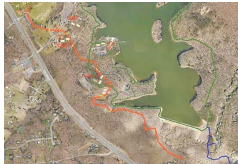
Burke Lake Park - Septic Field Study

Sunday ♦Lorton: May 1 - Nov. 13, 9 a.m. - 1 p.m.; VRE parking lot, 8990 Lorton Station Blvd.; SNAP accepted, bonus dollar program.