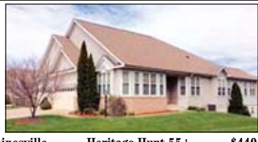
Gainesville Heritage Hunt 55+ $440,000 Beautifully updated 2 Lvl 'Turnberry' - fin walkout out lower lvl! Grmt Kit w NEW granite cntns, NEW SS Appls, NEW paint & carpet, HDWDS, Liv, Din, Fam rm off Kit, Sun rm, Deck. LL w Rec, BR, BA, Workshop, Storage.