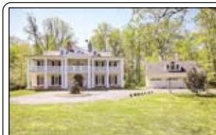
Falls Church $1,820,000 Phillips Estate