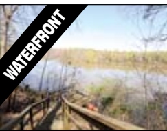
Lake Occoquan Shores RARE OPPORTUNITY $700,000

Secluded waterfront community of 5 acre+ homesites with spectacular water views and Fairfax County parkland! Solid brick home backs to lake with approx. 3,888 sq ft of living space. 5/6 bedrms, 3 totally remodeled full baths, 2 fireplaces, formal dining rm, deluxe kitchen w/ eating space adjoins Fam Rm leading to 62' deck overlooking lake! Rec Rm w/ bar, game/hobby rm, storage rm, bonus rm could be used as bedrm. Huge separate barn/workshop, covered RV pad, circular DW, and much more! Call Steve Childress NOW for private showing..... 703 981-3277