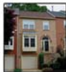
Open Sunday Fairfax Penderbrook $539,900 Golf Course View