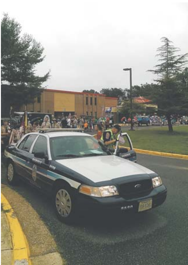
Community members assemble behind a Fairfax County Police officer before embarking on the Independence Day parade through the Orange Hunt neighborhood.