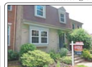
Fairfax $439,900 Newly Listed Convenient Kings Park West townhome with fresh updates to include paint and carpet. Hardwood floors on the main level and kitchen has newer cabinets. Walkout finished basement to patio and low-maintenance landscaping. Minutes to GMU and Robinson Secondary School.

Access the Realtors Multiple Listing Service: Go to www.searchvirginia.listingbook.com