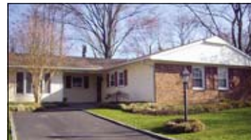
Fairfax RENTED $2,250

Great home conveniently located on a small Cul-de-Sac - Immaculate & ready to move into immediately! Recently renovated - New Refrigerator - HW Floors - Family Rm with Bay Window & Built-ins adjacent to Kitchen - Separate Laundry Rm.