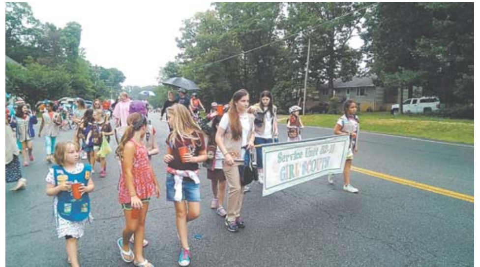
Boy and Girl Scouts groups were among the dozens of participants who made up the Orange Hunt Estates Independence Day parade, despite soggy conditions.