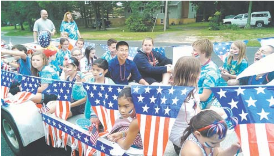
Members of the community swim team Cottontail Cobias shouted cheers while riding in their parade float.