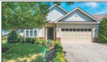
Gainesville Heritage Hunt 55+ $429,900 Main level living at its best! 2 BR, 2BA, Grmt Kit w NEW granite & island, NEW paint, HVAC updt'd, Din, Liv rm w 2 side Gas Fpl, Sun rm, Fenced Lndscpd yd, Patio, 2 car Gar.