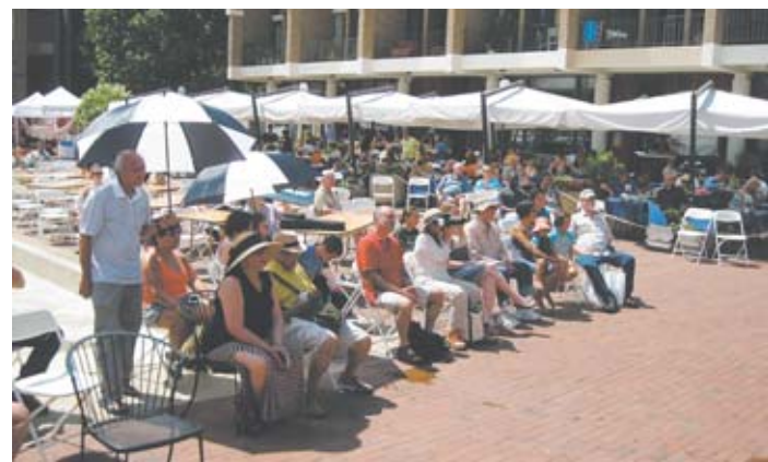
The crowd enjoys the Ukulele Festival at Lake Anne Plaza in Reston.