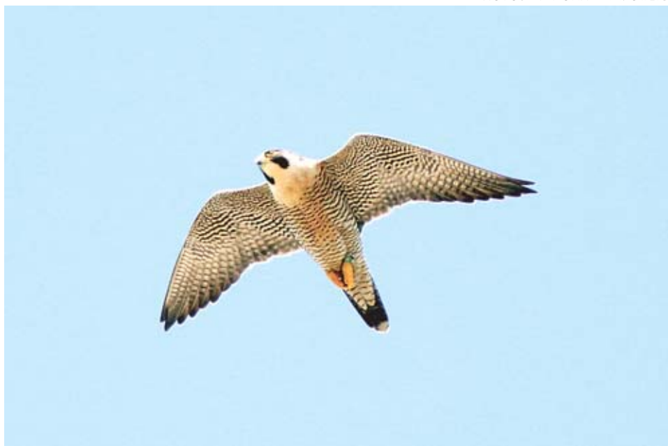
Male Peregrine falcon in the air over Reston on March 22, 2016.