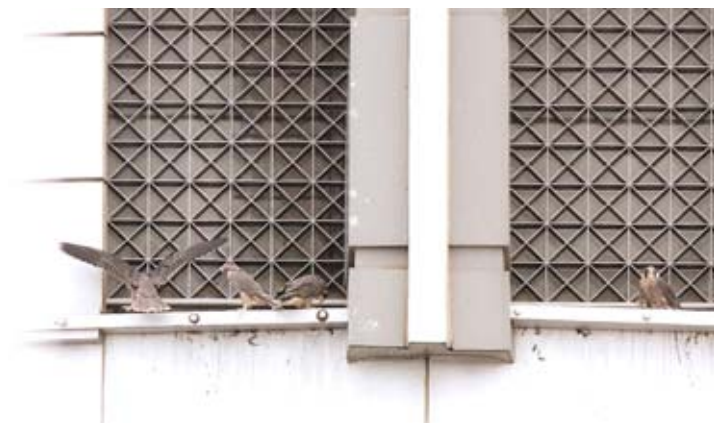
Note the bird on the far left exercising wings; it is actually slightly up in the air over the ledge.

Meanwhile, in the late 1960s, an unprecedented and innovative captive-breeding program was initiated, primarily at Cornell University and the Peregrine Fund in upstate New York. Subsequently, in Virginia, a Peregrine falcon restoration program was begun in 1978. Between 1978 and 1993