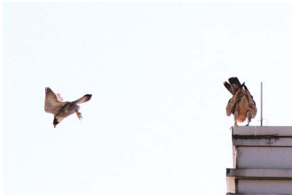
Male Peregrine falcon, on left, flies off after mating/copulating with the female on corner of Reston Office building on March 24, 2016.