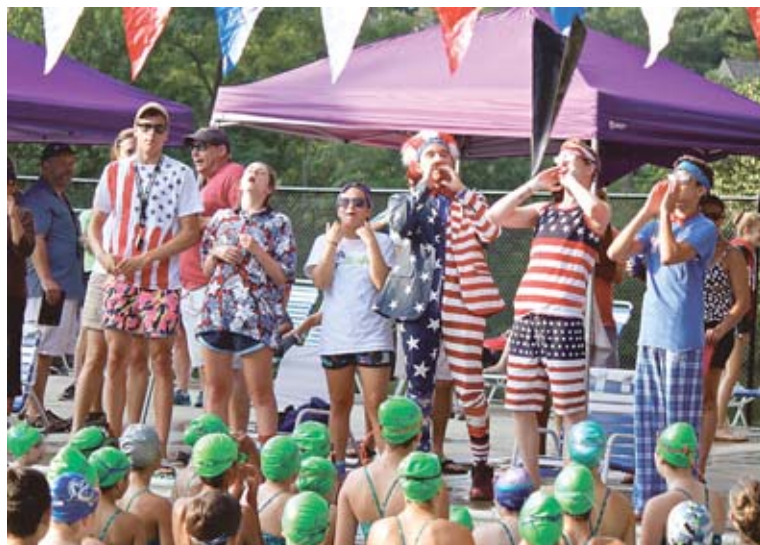
Glade July 4: Glade Swim team wearing red, white and blue.