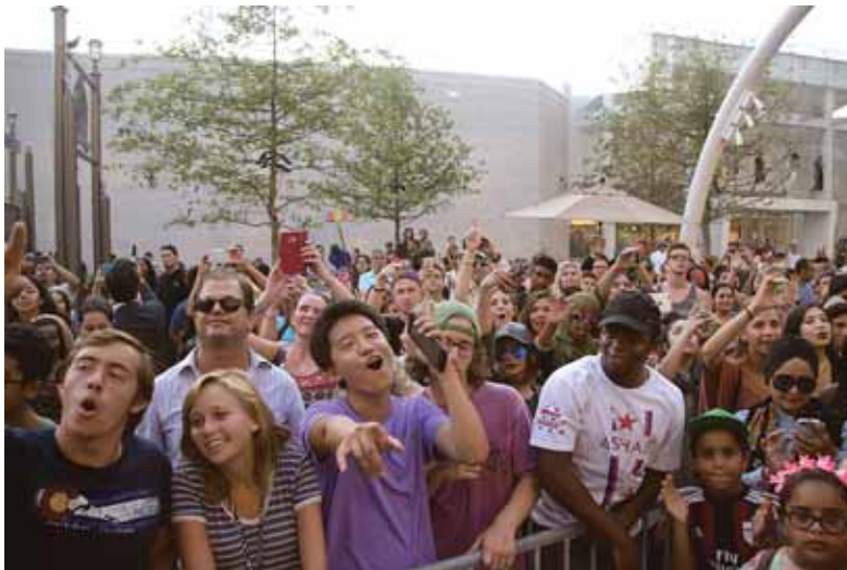
Residents of all ages weren't afraid to bust a move.