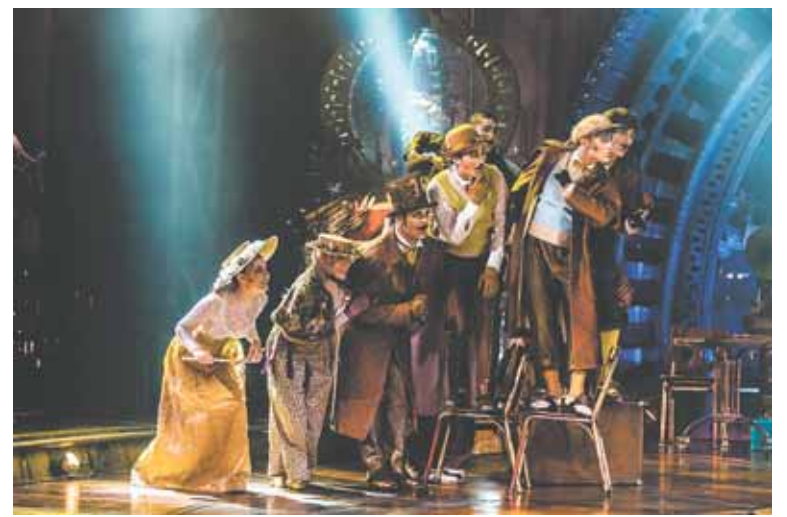
COSTUMES: PHILIPPE GUILLOT/2014 CIRQUE DU SOLEIL

McLean Farmers Market. 8 a.m.-noon. Fridays from May 6-Nov. 18. Lewinsville Park, 1659 Chain Bridge Road, McLean. The market provides area residents an opportunity to purchase locally grown or produced products. www.fairfaxcounty.gov/parks/farmersmarkets .