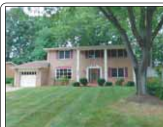
Fairfax $549,000 Kings Park West colonial featuring: 4 bedrooms * 2.5 updated baths * beautifully updated

kitchen that opens to private patio * fireplace in step-down family room * large back yard * near schools, GMU, shopping & VRE. Call Judy at 703-503-1885.