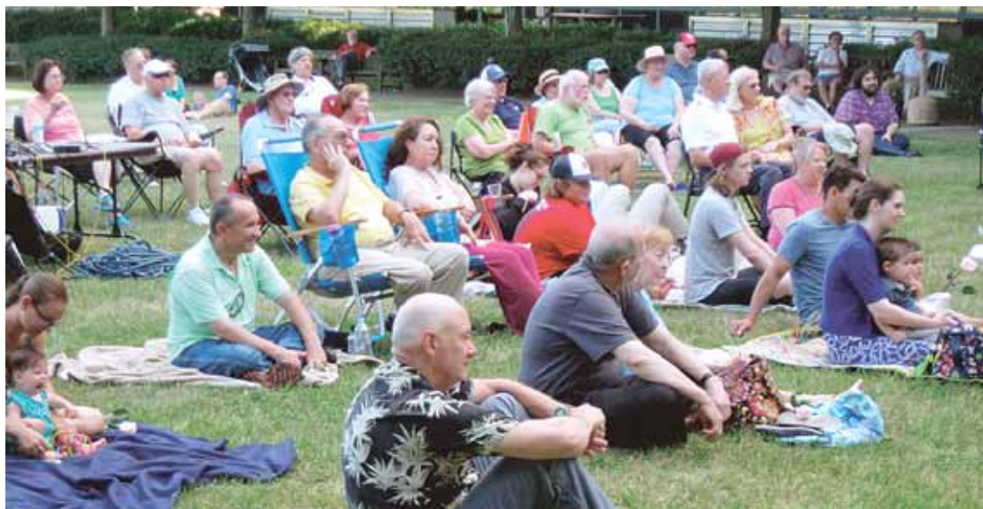
The crowd of people at the Evenings on the Ellipse at the Fairfax County Government Center in Fairfax.