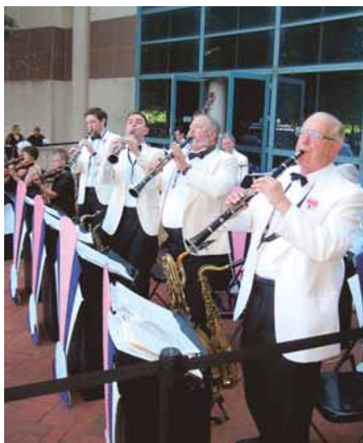
The Imperial Palms Orchestra plays a tune.