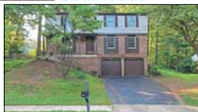
Burke Centre - $565,000 Terrific 4 BR, 2.5 BA home on lovely street in sought-after Burke Centre.