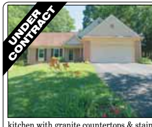
Springfield $609,000 Beautiful 5 level split on large cul-de-sac lot. 4 Bedrooms/3 Bathrooms. Fabulous great room addition! Updated

kitchen with granite countertops & stainless steel appliances. Hardwood floors. Many spaces for outdoor entertaining. Great neighborhood & schools.