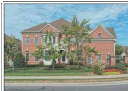
Fairfax $733,900 Elegant all brick Renaissance colonial with quick access to FFX Pkwy & I-66! Towering ceilings, refined trimwork, hwd floors, gourmet kitch, huge master BR suite w/ 2 walk-in closets. Home office. www.12701LadySomerset.info