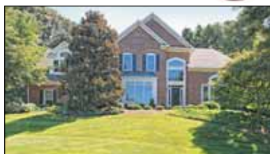
Fairfax Station - $1,045,000 Gorgeous, spacious custom home on beautiful .83 acre lot in conveniently located Donovans Ridge. Priced to sell!

Find More Information at: www.Hermendorfer.com