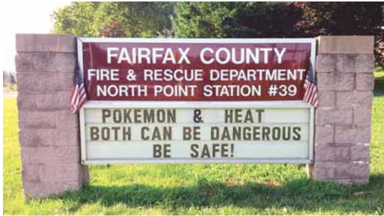
Safety alert for Pokémon Go players.

Police ask the public to be mindful of locations when playing the game. The game leads players