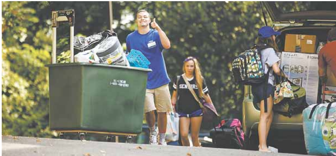
College students move into a residence hall at Marymount University.

Though it is the middle of summer, many families are preparing