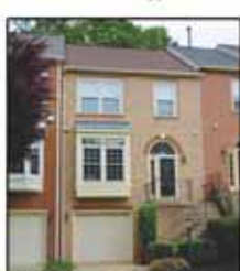
Fairfax • Penderbrook Golf Course View • $529,900