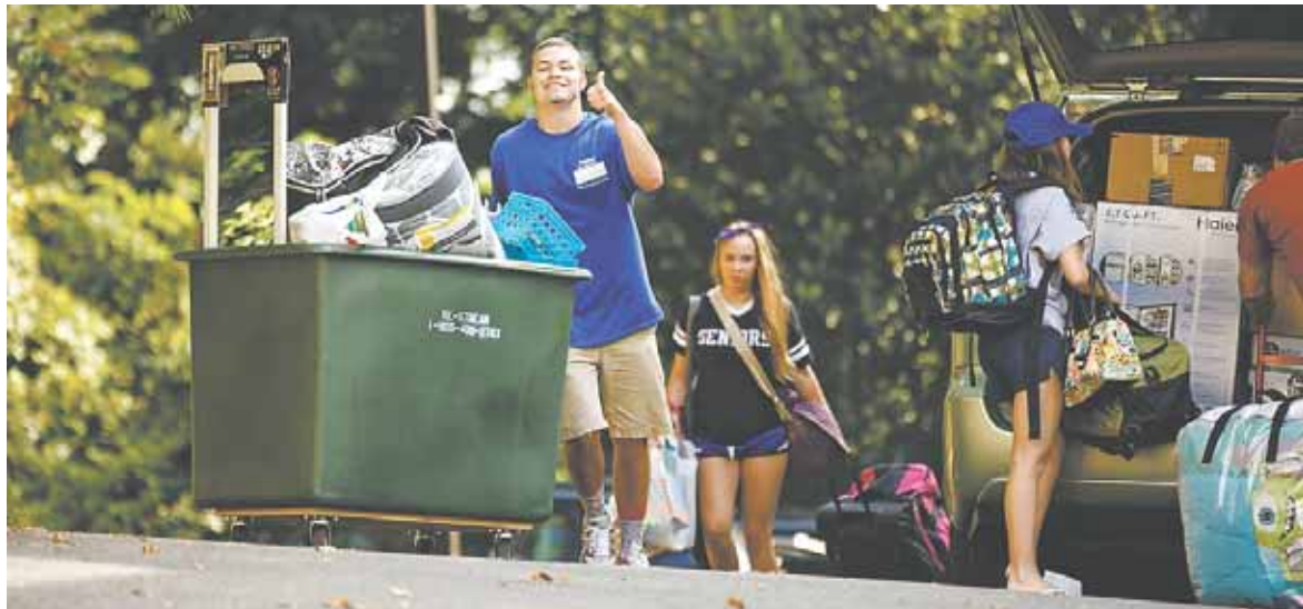
College students move into a residence hall at Marymount University.

Though it is the middle of summer, many families are preparing