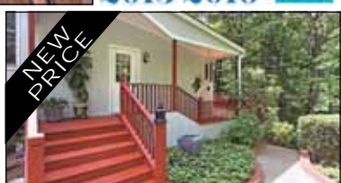
Clifton - $749,000