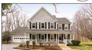
Clifton - $665,000

Find More Information at: www.Hermendorfer.com