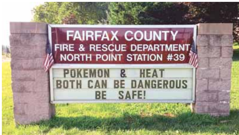
Safety alert for Pokémon Go players.

Police ask the public to be mindful of locations when playing the game. The game leads players