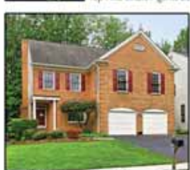
Fairfax • Penderbrook Open Floor Plan • $769,900