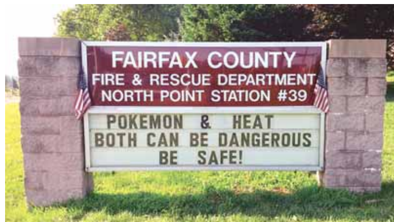
Safety alert for Pokémon Go players.

Police ask the public to be mindful of locations when playing the game. The game leads players