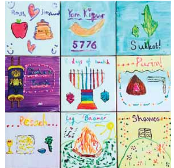
The school curriculum is taught through a variety of mediums such as, games, drama, songs, arts and crafts, workshops and holiday celebrations.

We offer a variety of extracurricular activities such as special guests, Friday night dinners, Holiday celebrations, and Shabbat morning fun. These events will