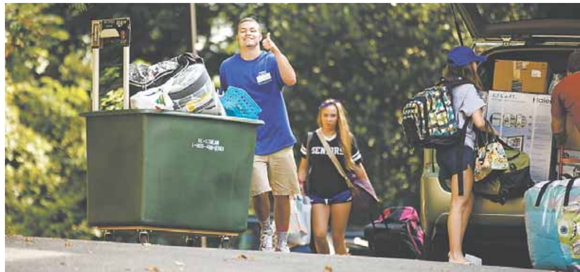
College students move into a residence hall at Marymount University.

Though it is the middle of summer, many families are preparing