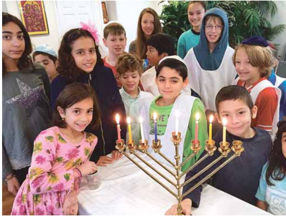
Chabad Tysons Hebrew School will host holiday celebrations for students and their families.

The curriculum is taught through a variety of mediums such as, games, drama, songs, arts and crafts, workshops and holiday cel-