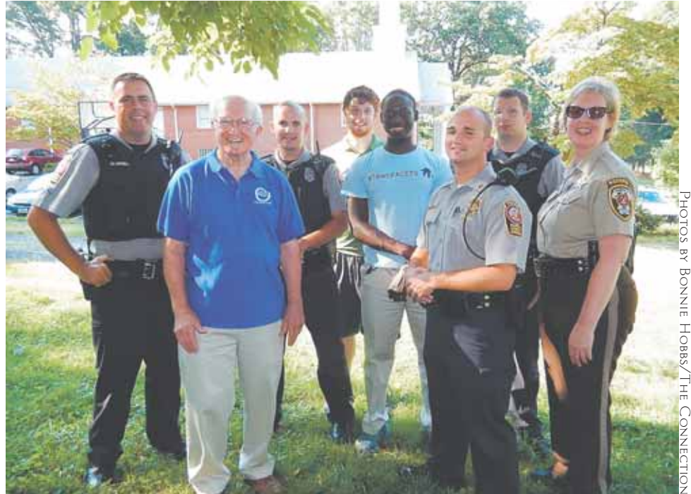
Church, FACETS and law-enforcement personnel gather for a photo in Ragan Oaks.

He said it's also good for children to know who's out there protecting them, "National Night Out builds good relationships; that's