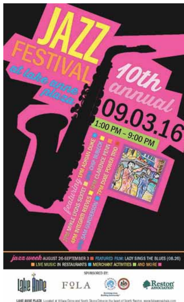
Poster announcing Jazz Festival.