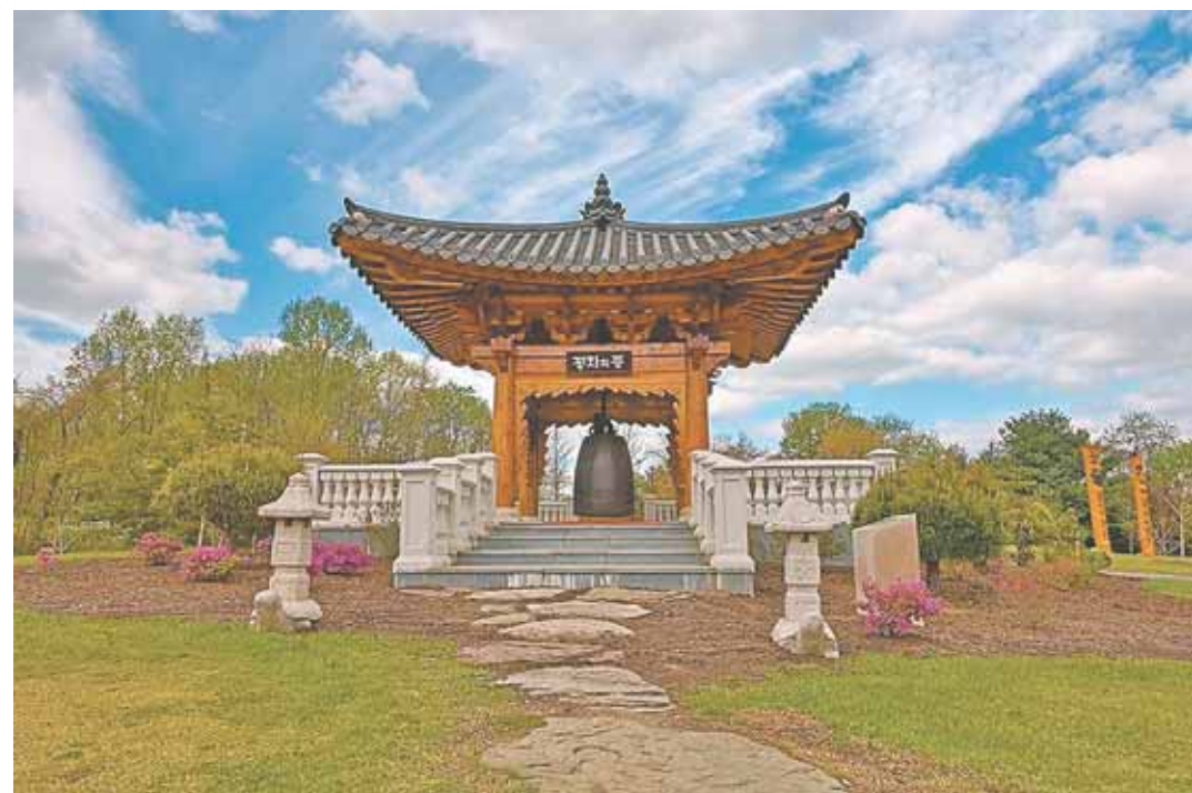
Korean Bell at Meadowlark Garden.

It is important to stay up to date on the news and events occurring in the Hunter Mill District. Whether upcoming events and news from the Supervisor, advisories, community updates or Snow Alerts, subscribe to the monthly Hunter Mill District Newsletter and get it all. If you have any questions or want to enroll for the newsletter, contact huntermill@fairfaxcounty.gov or call 703-478-0283.