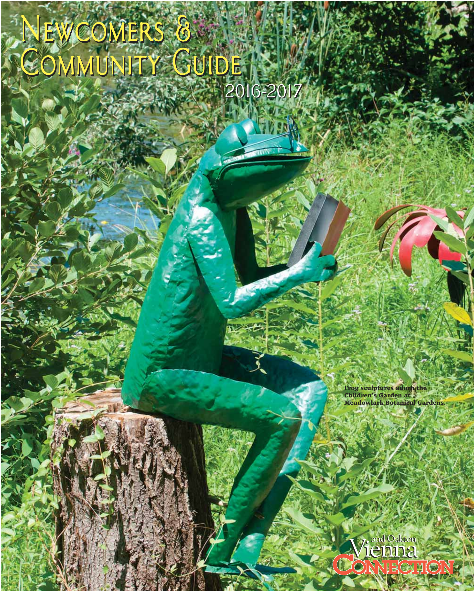
Frog sculptures adorn the Children's Garden at Meadowlark Botanical Gardens.