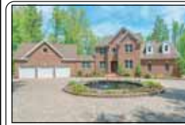
Woodbridge $1,250,000 Gorgeous custom build - all-brick Mike Garcia home on a 5 acre private waterfront peninsula. 6 BRs & 7.5 Baths. Spectacular wide water views from three sides. Huge gourmet kitchen. Newly renovated spa-inspired master bath. 2 tiered 700 SF entertainment-ready deck. Private boat dock & gazebo. Fire pit. Gated circular driveway w/pond & fountain. Super efficient geothermal HVAC system. Nanny suite over garage.