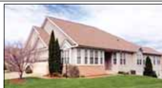
Gainesville Heritage Hunt 55+ (age 50+ ok) $440,000 Beautifully updated 2 Lvl Turnberry - fin walkout lower lvl! Grnt Kit w NEW granite cnts, NEW SS Appls, NEW paint & carpet, HDWDS, Liv, Din, Fam rm off Kit, Sun rm, Deck, LL w Rec, BR, BA, Workshop, Storage.