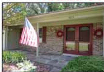
Coming Soon! • Mid $600's