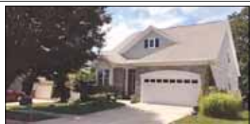
Gainesville Heritage Hunt 55+ (age 50+ ok) $599,900 PRISTINE 3 LVL DANBURY - SHOWS LIKE A MODEL - BACKS TO TREES! 3 BR, 4BA, Grnt Kit w grnt & mbrl, NEW SS appls, HDWDS, Liv, Din, Den, Sunrm, Scr Porch, Fin LL w Rec rm, Games rm, Card rm, Wet Bar, Workshop, Storage, Patio, 2 car Gar, Irrig Syst.