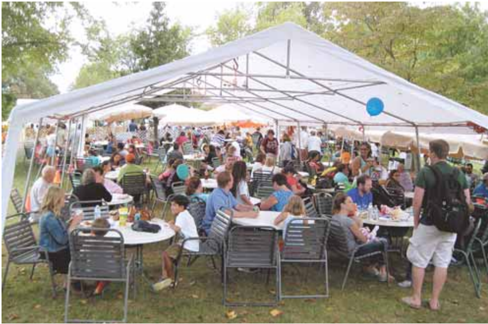
Diners relax under the tent during the 2015 Burke Centre Festival.