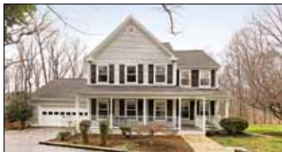
Clifton - $665,000 Classic Victorian Farmhouse on quiet 1.25 acres. Features warm hardwoods, open kitchen, screened porch & deck!

Find More Information at: www.Hermendorfer.com