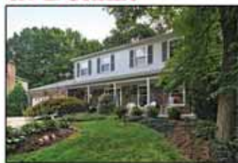
Under Contract in 15 Days! • $674,900