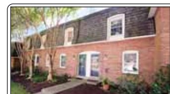
Springfield $269,900 Beautiful 3-level condo in sought after Cardinal Forest. Updated kitchen & baths, hardwood floors, new carpet & HVAC, newer windows & much more. Walking distance to schools, shopping centers, restaurants, pool, and Metro. All utilities except electric included in condo fee.