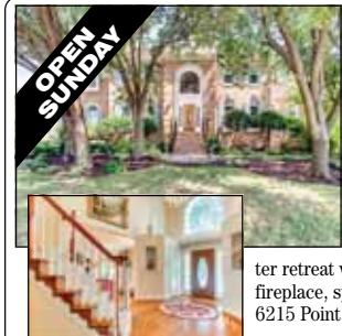
Centreville $744,900 Former model has it all! 5 Bds, 3.5 Bas, over 5500 sq ft! Dramatic floor plan w/2 story foyer, sunroom, and conservatory. True master retreat w/sitting room, fireplace, spa inspired bath. 6215 Point Circle.