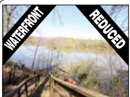
Lake Occoquan Shores RARE OPPORTUNITY $649,850

Secluded waterfront community of 5 acre+ homesites with spectacular water views and Fairfax County parkland! Solid brick home backs to lake with approx. 3,888 sq ft of living space. 5/6 bedrms, 3 totally remodeled full baths, 2 fireplaces, formal dining rm, deluxe kitchen w/ eating space adjoins Fam Rm leading to 62' deck overlooking lake! Rec Rm w/ bar, game/hobby rm, storage rm, bonus rm could be used as bedrm. Huge separate barn/workshop, covered RV pad, circular DW, and much more! Call Steve Childress NOW for private showing..... 703-981-3277