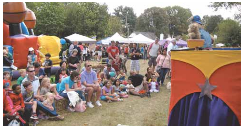
Puppets perform during the Kamp Kreature Show at the 2015 Burke Centre Festival.