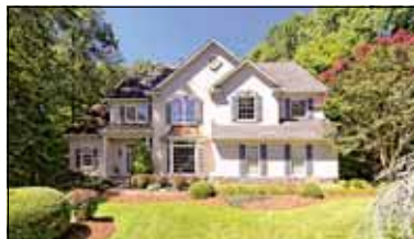
Fairfax Station/Regency Station - $975,000 Beautiful Executive home in gorgeous neighborhood. Features large main floor master suite with walk-out to private backyard.

Find More Information at: www.Hermendorfer.com