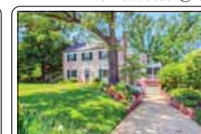
Alexandria $1,600,000 Quintessential Belle Haven Home A true Georgian center hall colonial on a one third acre lot in beautiful Belle Haven. With over 4500 finished square feet and set amidst an enchanting landscaped paradise this home is made for entertaining with formal as well as informal spaces and updates throughout. The modern spacious kitchen features a wall of windows overlooking the rear yard while a large deck off the kitchen offers outdoor dining and entertaining.

Access the Realtors Multiple Listing Service: Go to www.searchvirginia.listingbook.com