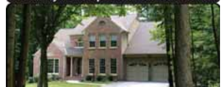
Coming Soon in Fairfax Station! Updated home in Ardmore Woods on 1 Acre close to Burke Lake, VRE and Fairfax Co. Pkwy Robinson School District