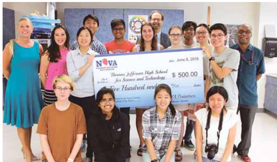
NOVA Pediatrics presented a check for $500 targeted to the art department at TJHSST.