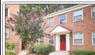
Arlington $277,400 Cambridge Courts Turn-key condition. Shows like a model. Secluded

end-unit. Prime location tucked away in back of neighborhood. Frpl in LR. Sep DR. Large BR w/walk-in closet. Multiple improvements to incl remodeled bathroom, new windows, new appliances, granite counters, hwdw floors, fresh paint & more. Low condo fee. 1.2 mi to Clarendon Metro. This is a "10."