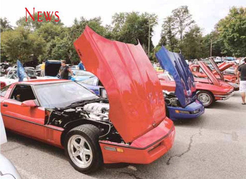
Cars such as these will be on display in Fairfax on Labor Day.