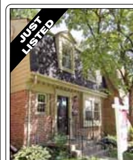
Fairfax $410,000 Fantastic in Fairfax Newly renovated and freshly painted, this 3 BR, 2.55 BA TH is a MUST SEE! HW Foyer & DR. New SS appliances, new ceramic tile, new counters in Kit and MORE. Fin LL Rec Rm. Backs to woods.