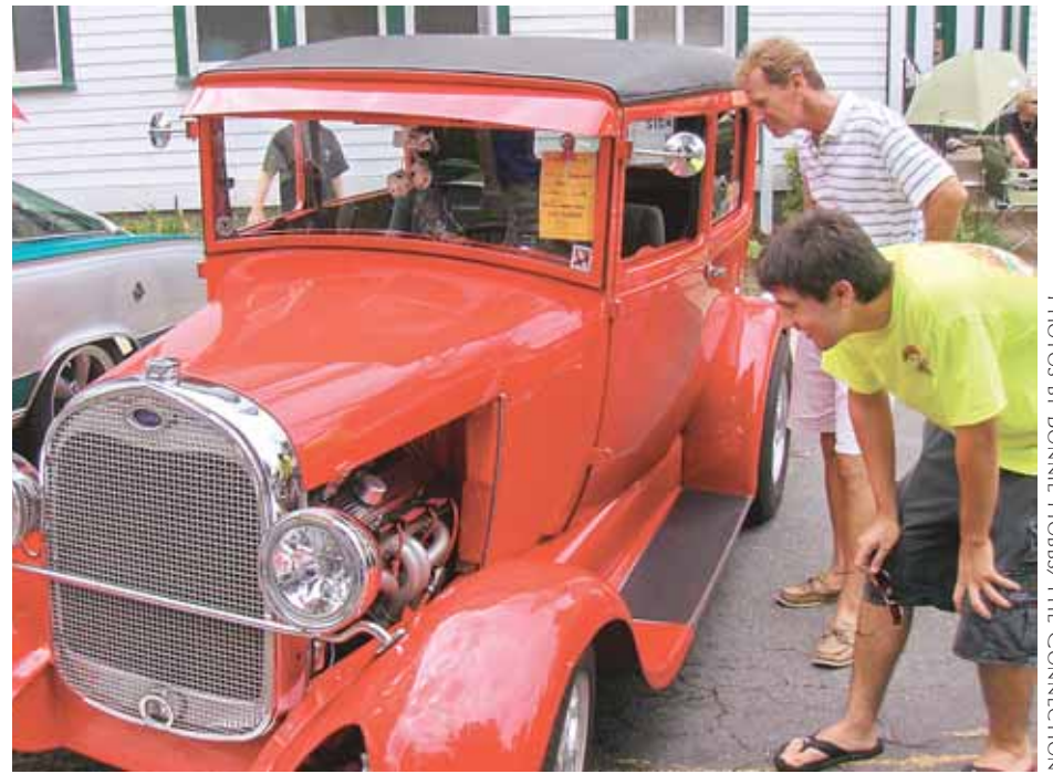
Two young men marvel at this 1929 Ford in a past show.