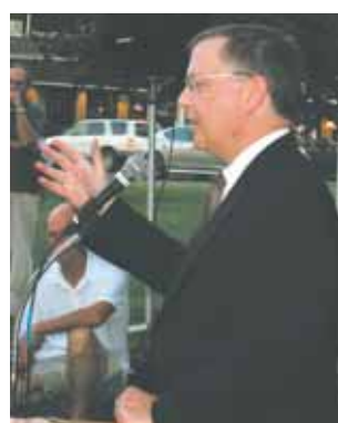
Keynote Speaker Chuck Rosenberg, Acting Director of the Drug Enforcement Administration.