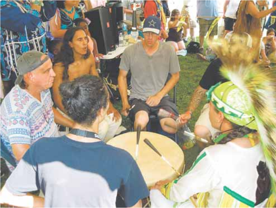
The Rappahannock Tribe from Indian Neck, Va., plays drums in a circle.