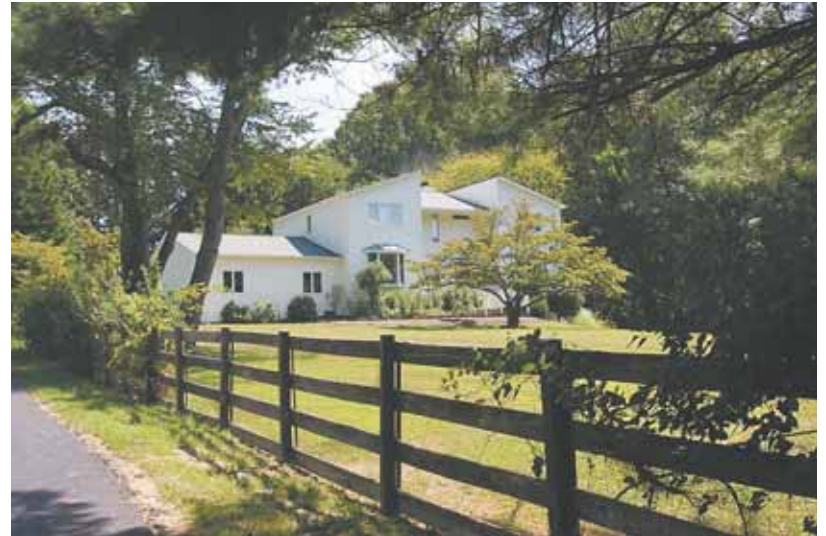
3 443 Springvale Road — $1,732,000