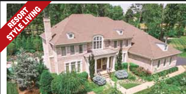
Great Falls $2,425,000