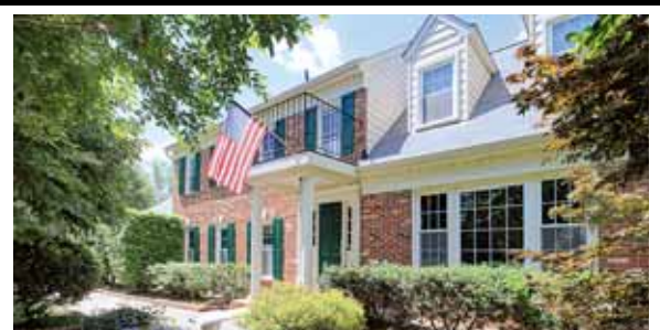
Great Falls $775,000