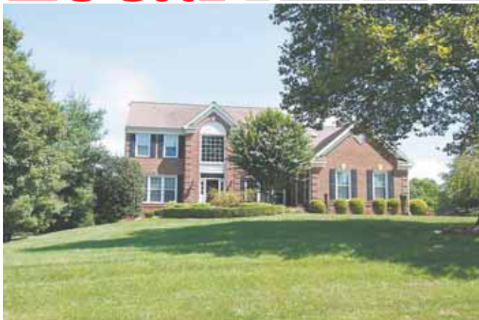
8 658 Nalls Farm Way — $1,140,000