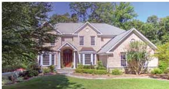
Great Falls $1,399,000