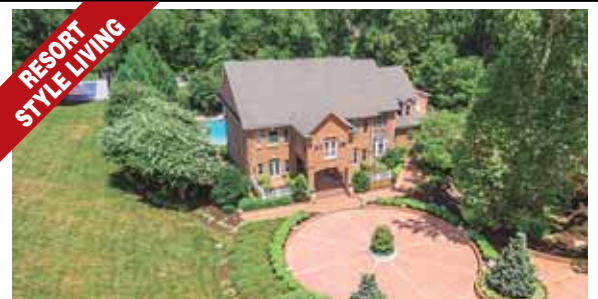
Great Falls $2,595,000