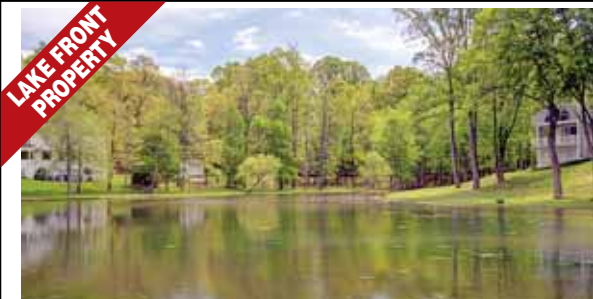
Great Falls $1,148,000