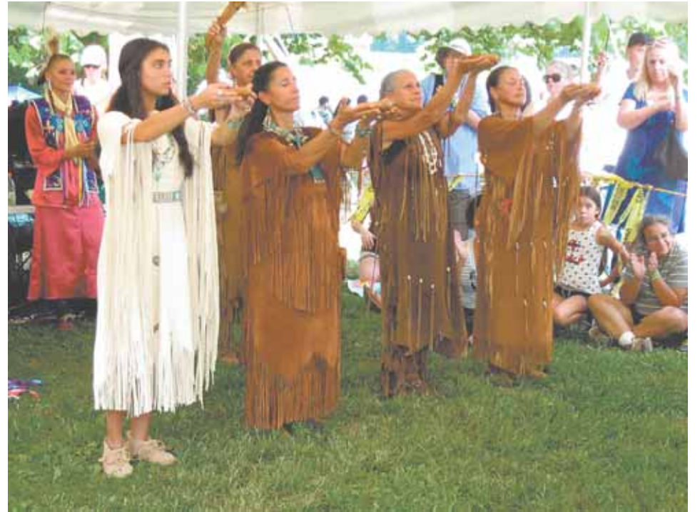
The women from the Rappahannock Tribe from Indian Neck, Va. do a sacred dance.