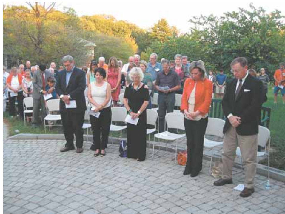
About 50 members of the audience say a prayer during the 9-11 Memorial Ceremony in Great Falls.