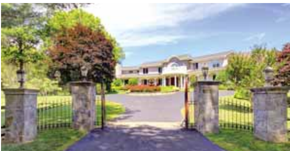
Great Falls $2,395,000