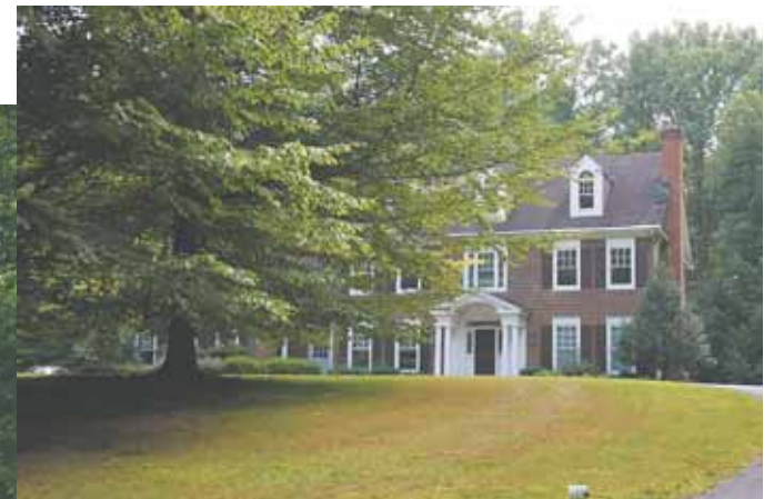
7 11221 Potowmack Street — $1,199,999