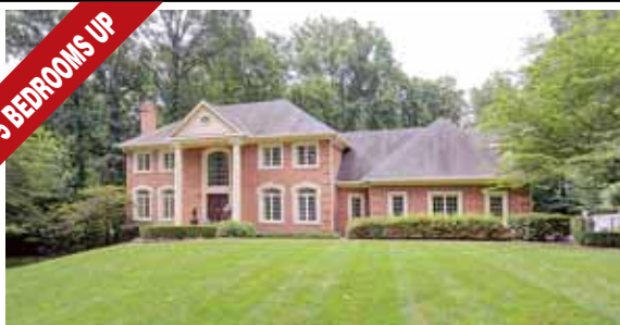
Great Falls $1,399,000