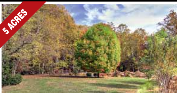
Great Falls $1,199,000