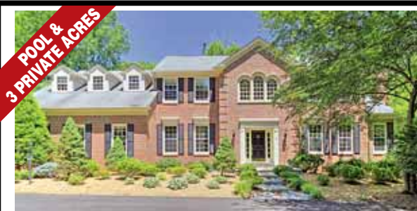
Great Falls $1,399,000