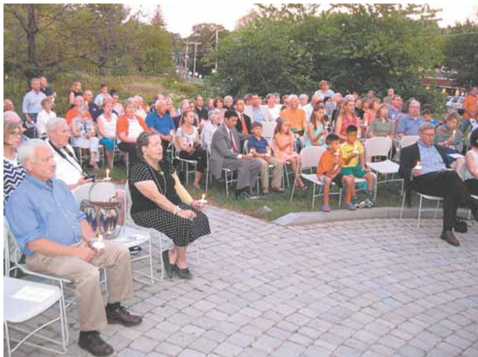
The audience holds lighted candles during the 9-11 Memorial Ceremony in Great Falls.