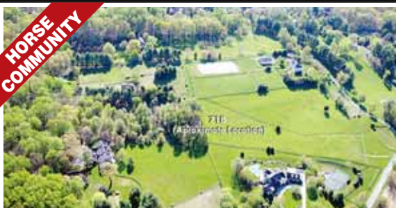
Great Falls $1,250,000