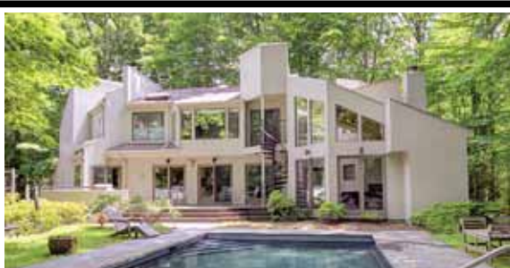
Great Falls $1,050,000