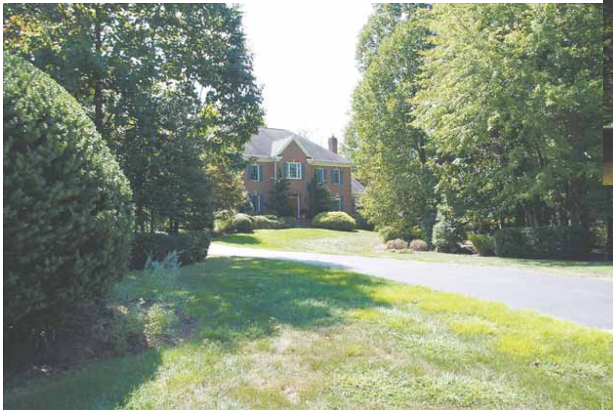
2 11547 Tralee Drive — $1,795,000