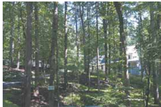
9 10716 Fawn Drive — $1,050,000