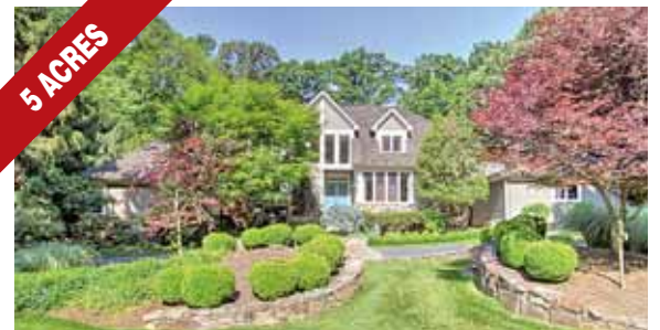
Great Falls $1,399,000