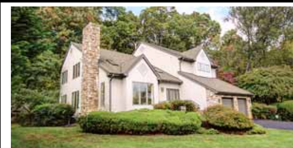
Great Falls $1,199,000