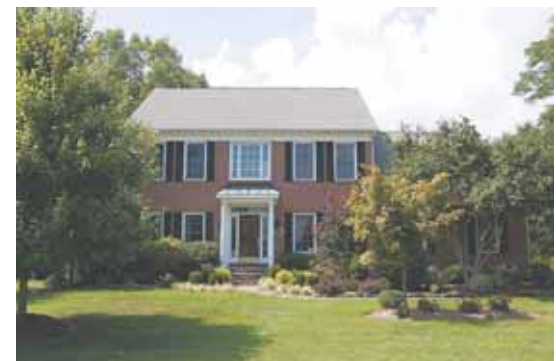
10 858 Constellation Drive — $1,050,000