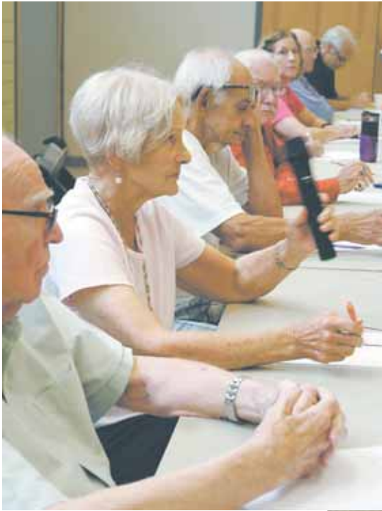
The Senior Olympics Spelling Bee, held at Lee Community Center on Lee Highway in Arlington, rounded out the 12 days of competition in the Northern Virginia Senior Olympics from Sept. 10-21.