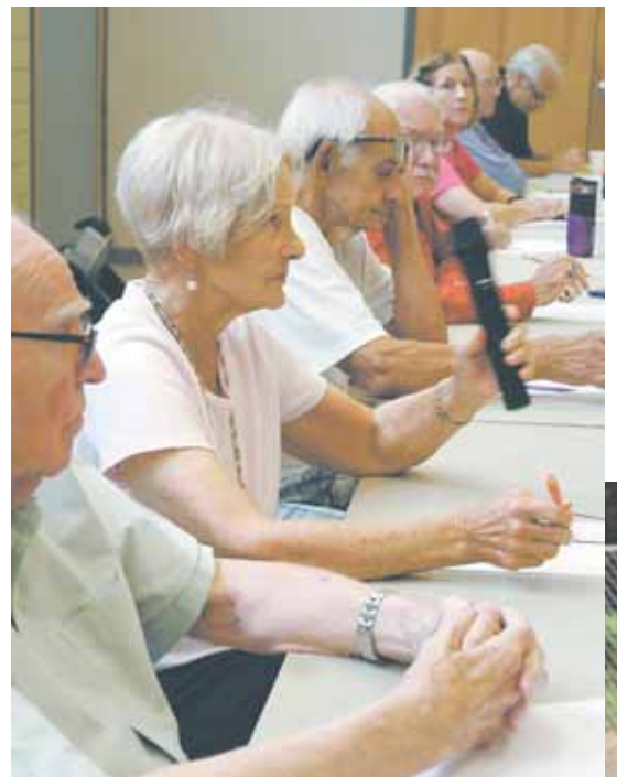
The Senior Olympics Spelling Bee, held at Lee Community Center on Lee Highway in Arlington, rounded out the 12 days of competition in the Northern Virginia Senior Olympics from Sept. 10-21.