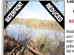
Lake Occoquan Shores RARE OPPORTUNITY $623,500

"Experience...with Innovation!" Life Member NVAR Top Producers Buyer Broker since 1973! 703-981-3277