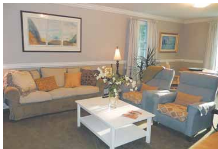
A glimpse of the comfortable living room.

Meanwhile, he enlarged his grandma's home at 3503 Burrows Ave. from 1,700 to 5,000 square feet. It now contains eight bedrooms with eight, individual bathrooms. It took 18 months to build them, with the renovation work completed in June.