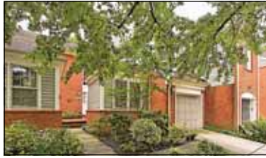
Alexandria - Belle Haven on the Green - $619,900

Fantastic, move-in ready 4 BR home. Updated Kitchen & Baths. Beautiful landscaping. Close to schools, transportation & ALL amenities.