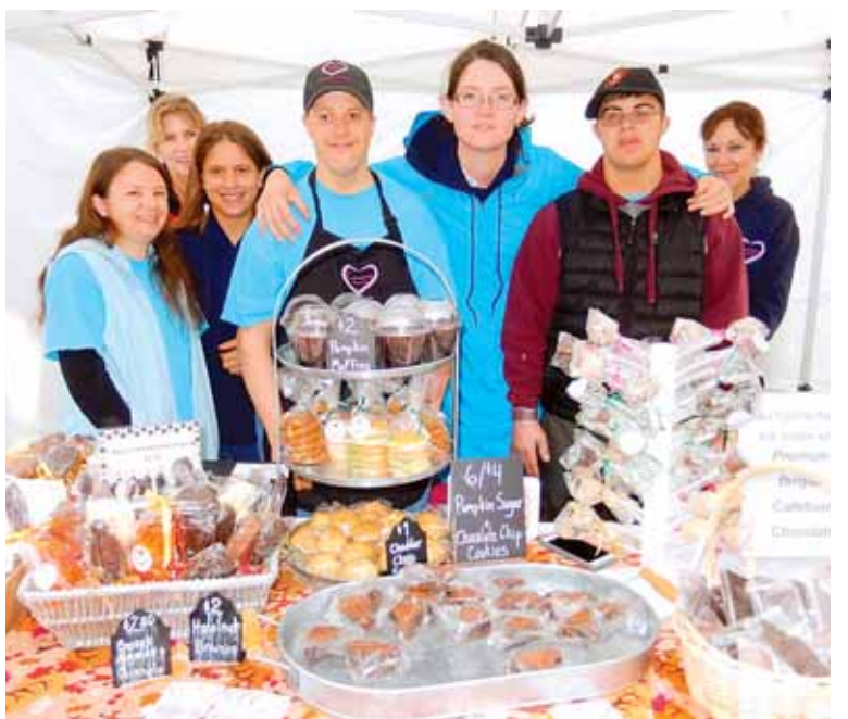
The Cameron's Chocolates staff offers chocolate and pumpkin treats.

Wicked Olde performs a Celtic song at Old Town Square.