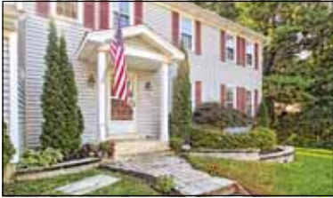
Burke Centre - $614,900

Hermandorfer Associates Top 1% of Agents Nationally