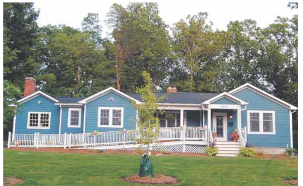
There's a long ramp in front of the home on Burrows Avenue.