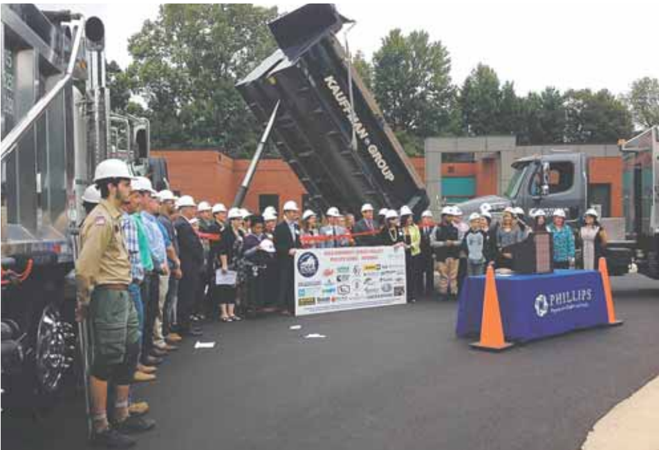
Representatives of the companies participating in the project.

milling and disposing 350 tons of asphalt from the existing driveway and bus circle; preparing the surface and paving with 350 tons of new asphalt; excavating and rebuilding ADA compliant ramps with 27 cubic yards of concrete; repainting curbs and crosswalks; and replacing 15 directional signs. A ribbon cutting ceremony was held on Monday, Sept. 26.