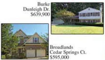
Burke Dunleigh Dr. $639,900