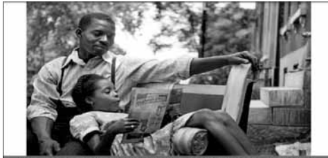
THE VIRGINIA MUSEUM OF FINE ARTS PRESENTS