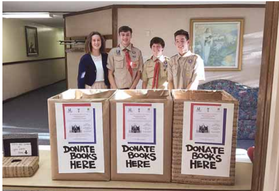
Volunteers by book boxes: The book drive continues through Oct. 29.

“Eurydice” is a powerful tale of love ready to tug at the heart and mind.