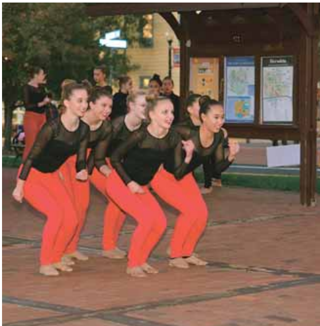
A fabulous troupe from Rhythm Street Dance Center in Herndon performed a number of routines that earned them a lot of toe-tapping and finger-snapping accompaniment from the “crawlers” who stopped to watch. A bit of a chill and brick-instead-of-wood for their stage were no obstacles to these energetic young ladies.