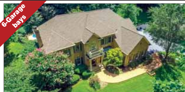
6 Garage bays Great Falls $1,549,000