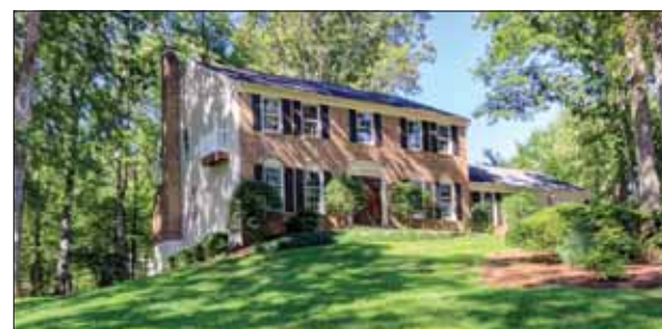
Great Falls $999,999