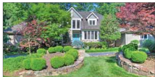
Great Falls $1,399,000