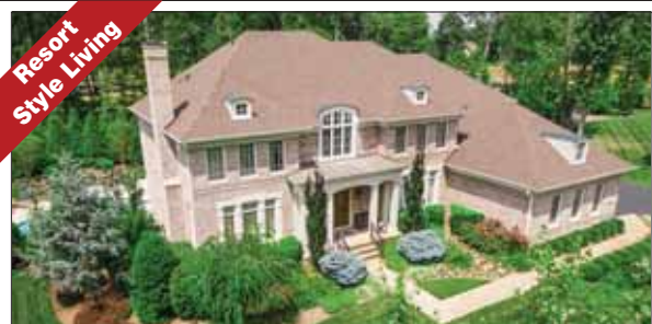
Resort Style Living Great Falls $2,425,000