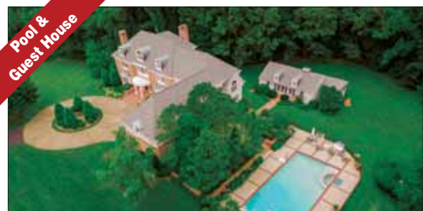
Pool & Guest House Great Falls $2,399,000