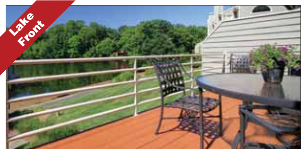
Lake Front Reston $799,999