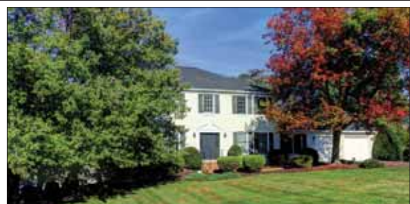
Great Falls $1,295,000