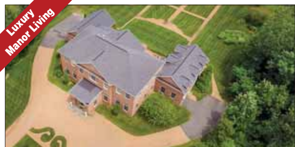
Luxury Manor Style Living Great Falls $2,248,000