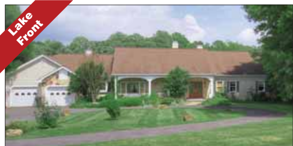
Lake Front Great Falls $1,148,000