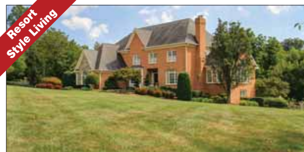
Resort Style Living Great Falls $1,375,000