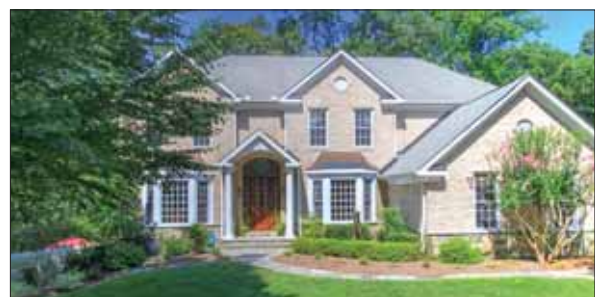
Great Falls $1,399,000