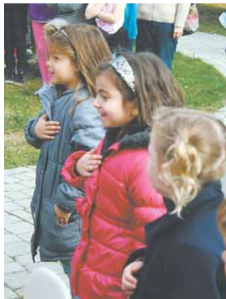
Kindergartners from the Village Green Day School in Great Falls lead the ceremony’s Pledge of Allegiance.

he was a combat parachutist with the Army’s 101st Airborne Division decades ago if his story wasn’t told.