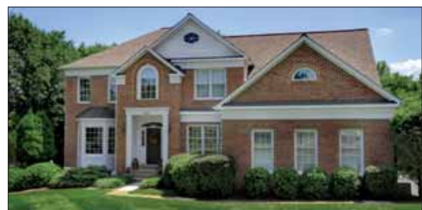
Great Falls $1,099,000