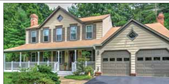
Great Falls $758,000