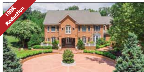
100K Reduction Great Falls $2,495,000