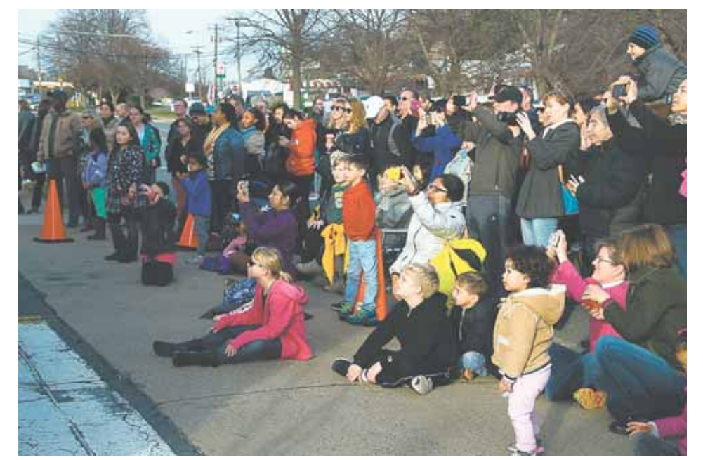
Old Chain Bridge Road was closed down for the parade, allowing guests to enjoy the musical performances and food trucks during 2015 WinterFest Parade in McLean.

The parade steps off promptly at 3:30 p.m. on Sunday, Dec. 4. This year's WinterFest parade will be bigger and better than ever. Go to www.mcleanwinterfest.org to see the local businesses that have donated to WinterFest to help make it a success. You can also find additional parade information such as parking options, the parade route and road closure points.