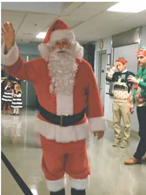
To a rousing recorded version of "Here Comes Santa Claus," Santa Claus came.