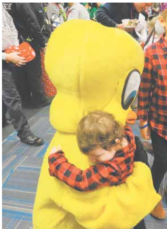
A child at United Airlines Fantasy Flight knows the best gift of any season, is a welcoming hug.