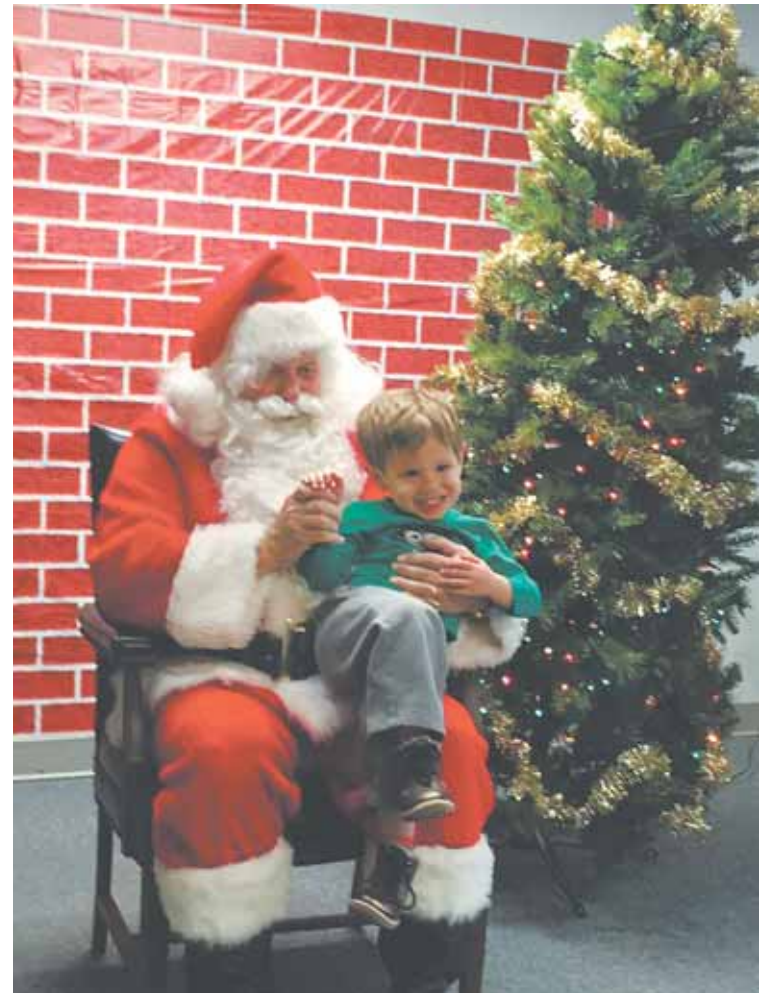
The little kids appeared to get shy sitting on Santa's lap so Santa used his North Pole skills to engage them.