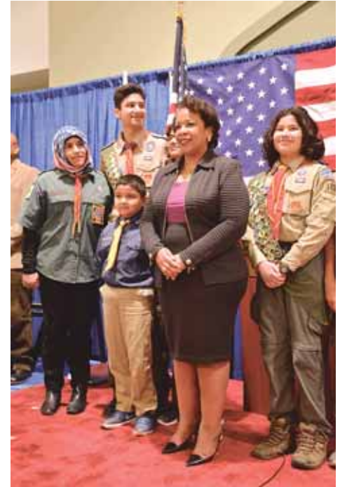
US Attorney General Loretta Lynch poses after the Interfaith event with some of the scout troops from the ADAMS Center. ADAMS is heavily involved in scouting programs and a large number of its youth participate in scouting.

“It’s always been hard [the fight for equality in the United States].” Calling on all Americans to work in partnership to protect the progress made “by the sacrifice of so many” and move the country forward, Lynch closed with the reminder that the “highest office in the land, the most power-