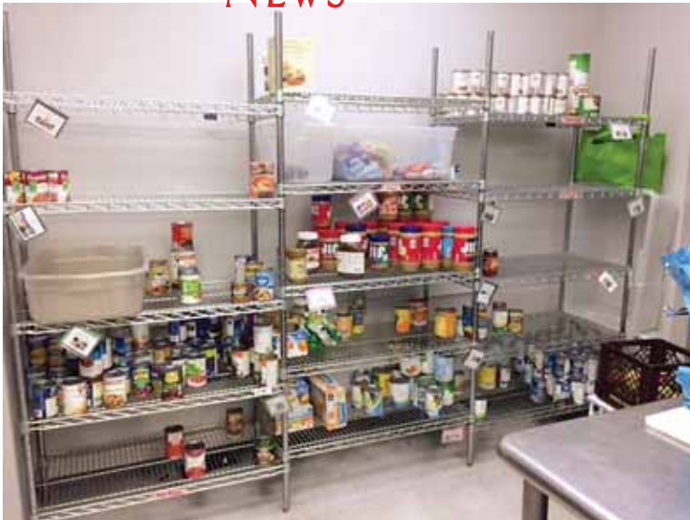
This is what the Cornerstones Reston Pantry shelves looked like before the “A Simple Gesture” bags arrived, according to Bob Schnapp.