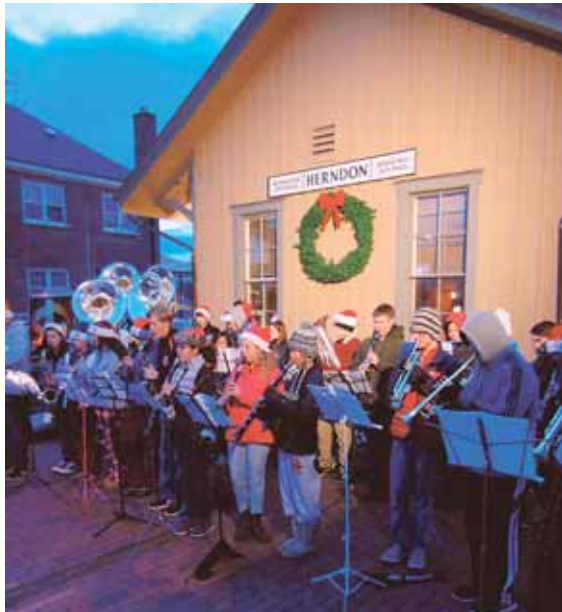
The Herndon High School Bands plays Christmas Carols during the Tree-Lighting Ceremony on Saturday, Dec. 3 in front of Herndon's Old Town Hall on Elden Street.