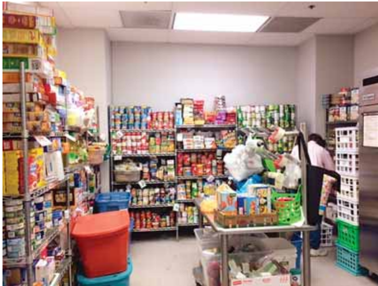
This is what the Cornerstones Reston Pantry shelves looked like after the “A Simple Gesture” bags arrived, according to Bob Schnapp.