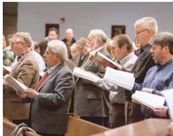
Basses join in and sing at the Reston Chorale's Messiah Sing-Along at Saint John Neumann Catholic Church on Dec. 6.

Encore Chorale is the largest growing choral music program for older adults in the country.