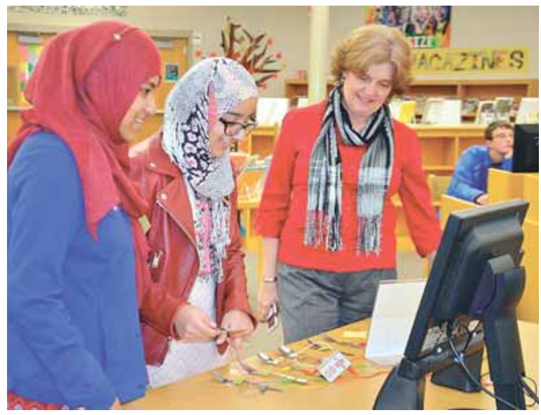
Hour of Code girls at Lee High School. hour of code girls