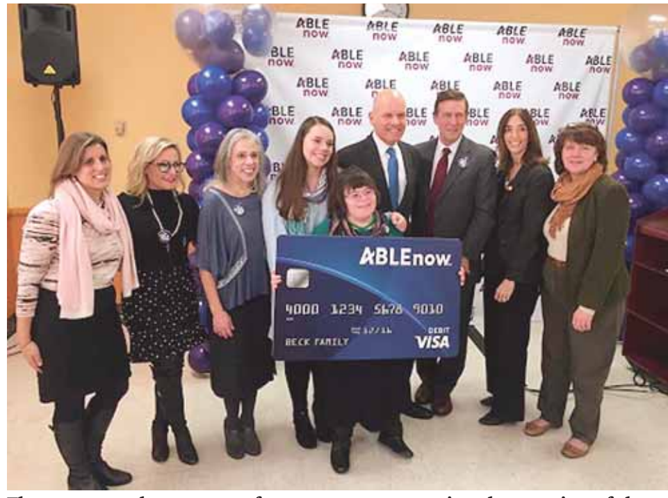
The guests at the press conference commemorating the opening of the first ABLEnow account in Virginia.