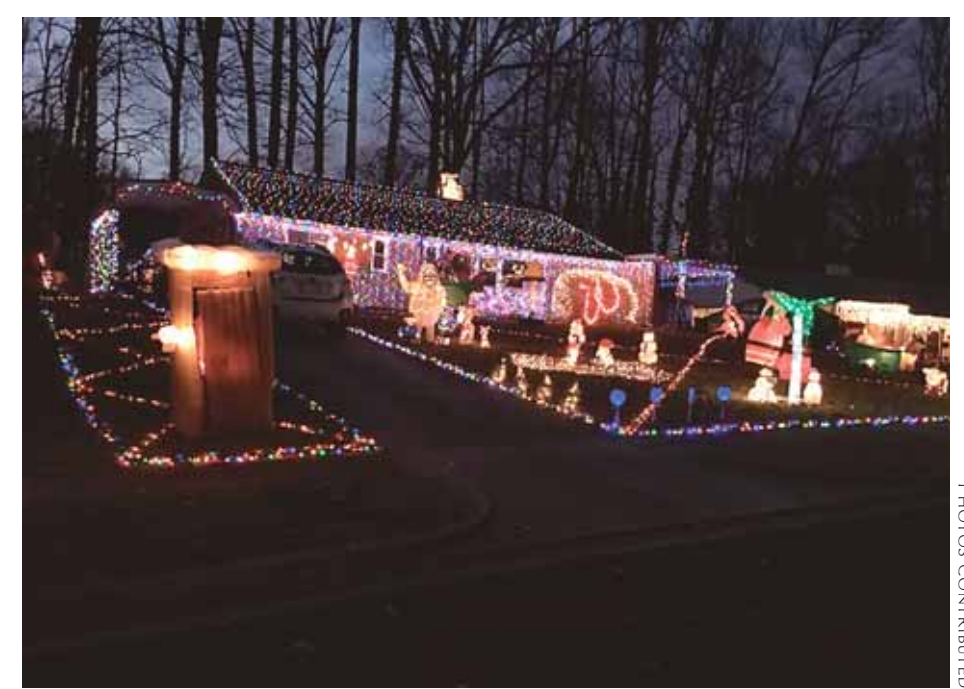
Another one of the North Springfield Civic Association's list of "Must-See" houses from the 2016 holiday lights judging includes Cousin Eddie from "National Lampoon's Christmas Vacation" and an outhouse with a disappearing and reappearing Santa Clause.