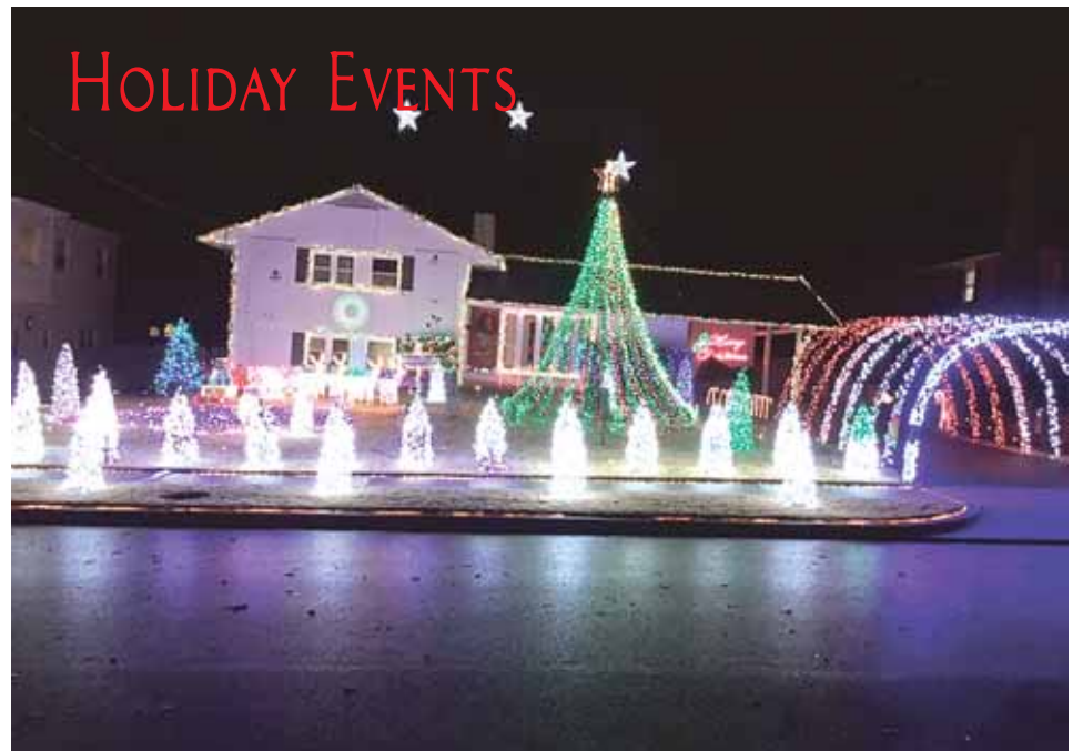
While others may eclipse the yard for sheer wattage or bulb count, the house on Fremont St. in Springfield boasts a 20-minute display timed to music playing in the yard or available by tuning into 107.9