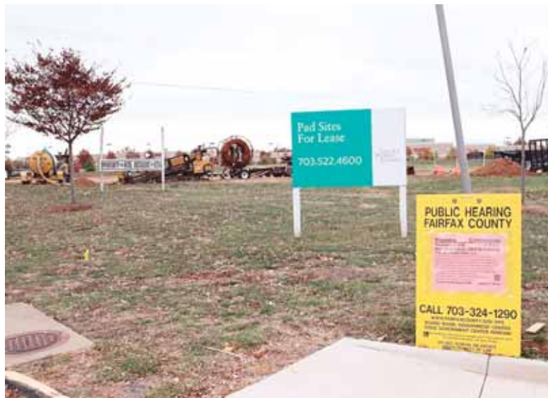
Lidl U.S. Operations, LLC, awaits final approval from the Board of Supervisors to permit a 30,000-square-foot grocery store and 18,000-square-foot multi-tenant retail building on 5.09 acres on the 73-acre Chantilly Crossing Shopping Center at the intersection of Lee Road and Chantilly Crossing Lane.

The two-lane drive through has the capacity to stack 20 vehicles.