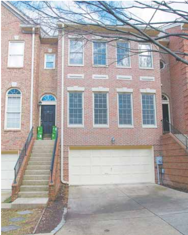
2 7819 Oracle Place — $835,000