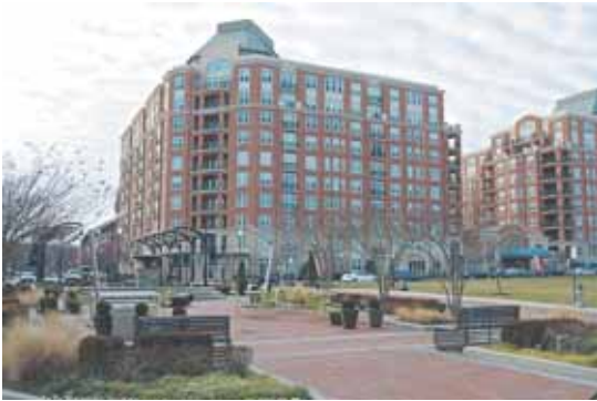
7 12500 Park Potomac Avenue #404 S — $795,000