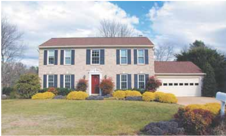
4 9829 Wilden Lane — $813,000