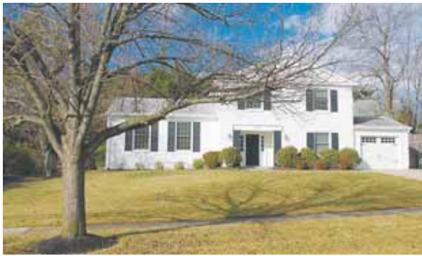
8 1993 Milboro Drive — $787,500