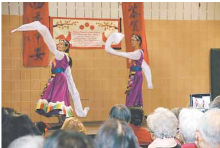
Tibetan Dancers perform at the Potomac Community Center.