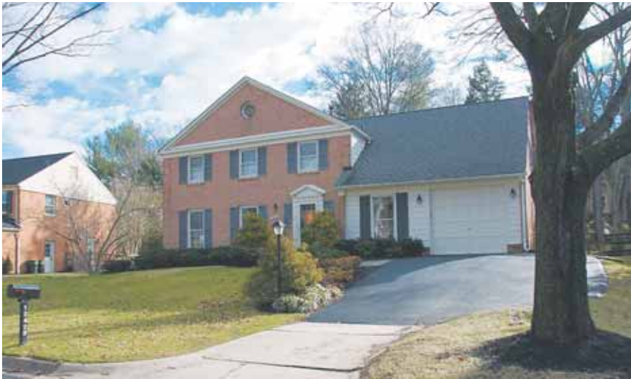
3 12429 Over Ridge Road — $830,000