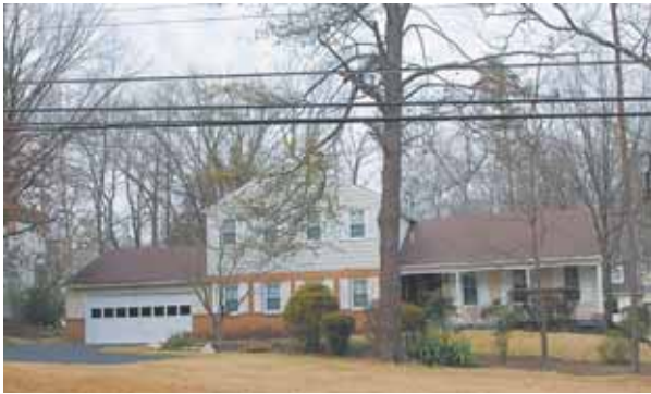
9 9113 Bells Mill Road — $785,000