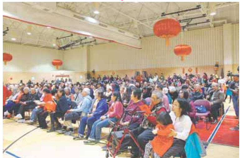
The Potomac Community Center was filled for the Chinese New Year celebration.