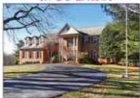
Fairfax Station • 5 acres w/ Pool $1,175,000