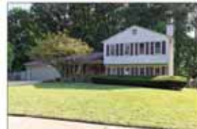
Burke • 5 Bdrm Split Level $639,900