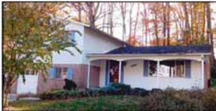
Fairfax - $464,000

Kings Park West 4 level split featuring a front porch & back patio * wood floors on 2 levels * walkout dining room & family room * 4 bedrooms * 3 baths * dead-end street.