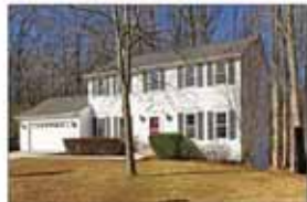
Burke • Cherry Run $625,000