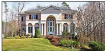
Fairfax Station - $1,250,000

Feels like brand new! Gorgeous updates throughout including walk-out lower level! Enjoy views of 5 peaceful acres from screened porch, deck or patio.