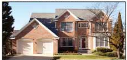
COMING SOON! Clifton

Picture perfect colonial with 3 finished levels, 4 bds, 3.5 baths, walk out LL with Nanny / In Law Suite. Private cul de sac, fenced backyard, great deck for entertaining.