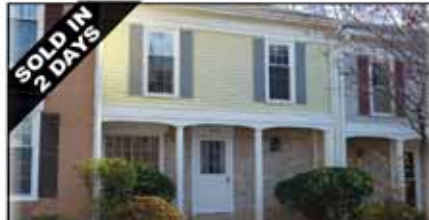
Fairfax Townhome in Glen Cove - $350,000

Kings Park West 4 level split featuring a front porch & back patio * wood floors on 2 levels * walkout dining room & family room * 4 bedrooms * 3 baths * dead-end street.