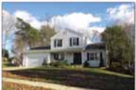
Burke • Cherry Run $589,900