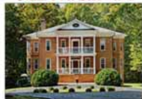
Clifton • 5 acres w/ Pool $1,199,000

Quality marketing will get your home sold FAST!