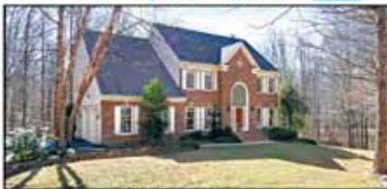
Clifton - $939,000

Hermandorfer Associates Top 1% of Agents Nationally