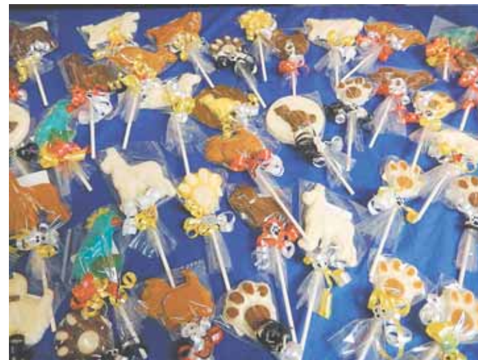
Animal-shaped, chocolate lollipops at the reception.