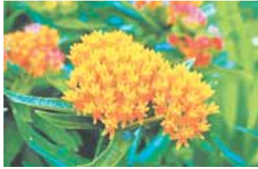
The butterfly weed

Native to much of the continental United States as well as Ontario and Quebec, butterfly weed grows wild in a variety of climatic conditions including dry forests, along roadsides and in prairies and open fields. A member of the milkweed family, it tops out at about 1 to 2 feet. Its natural preference for average to dry soil makes it an excellent drought-resistant plant.