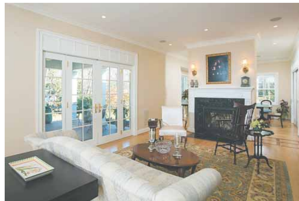
The split-level’s former bow window was converted to a set of French doors which overlook the new veranda. Though the execution makes the addition hard to detect, the dining room beyond the fireplace is actually in the home’s new wing.

“The structural challenge was finding an optimal way to raise the front door to the main level of the house,” Gallagher said.