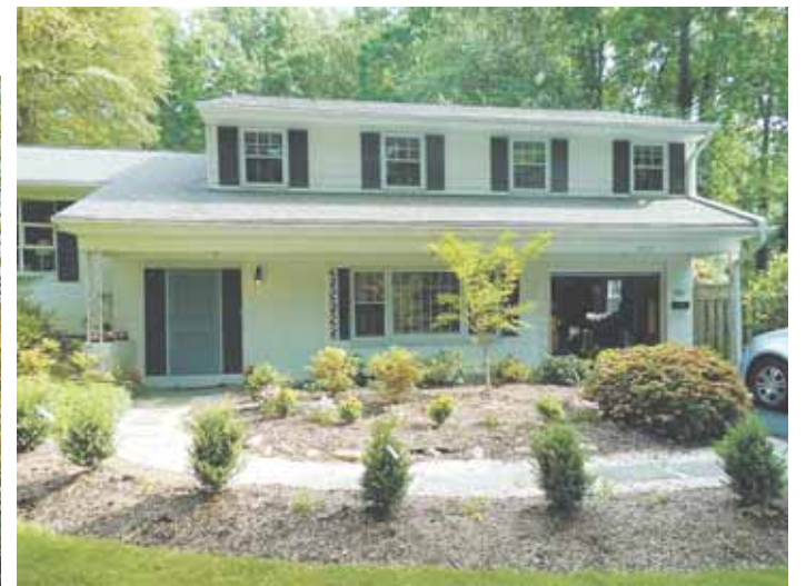
BEFORE: Above, owners Jack and Marie Torre wanted square footage for a larger kitchen and dining room, but “set-back” rules prohibited building in the rear, and the front-facing roof overhang limited options for re-designing the facade.