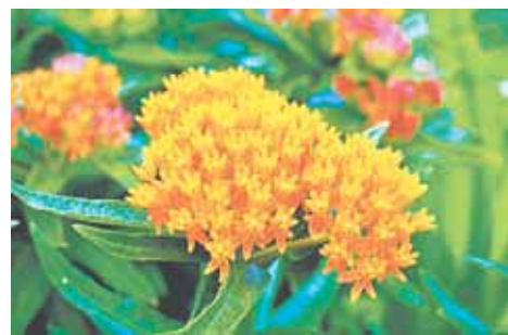
The butterfly weed

The designation Perennial Plant of the Year is awarded each year by the Perennial Plant Association to the perennial that outshines its competitors not only in appearance, but also in its noteworthy characteristics. To be considered, a plant must be able to grow in a wide range of climates, require little maintenance and have multiple seasons of in