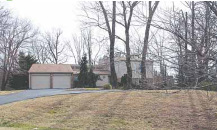
3 9412 Woodington Drive — $880,000