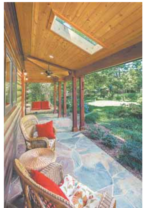
Underfoot, a flagstone patio lends setting-appropriate color and texture. The Velux skylight allows needed available light.

“This is a very sweet place to be spend-